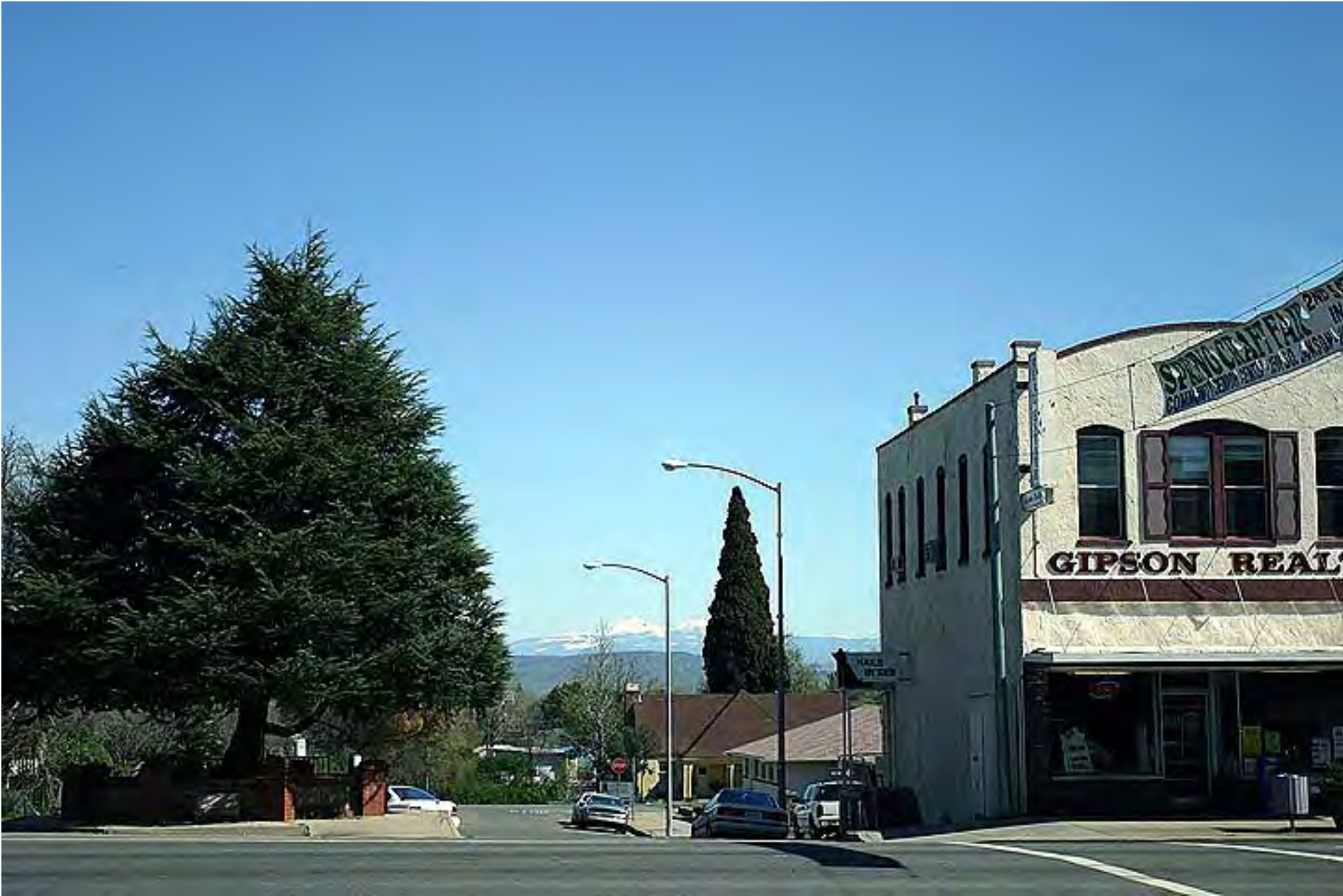
You can see Mt. Lassen from the main street. (2004)