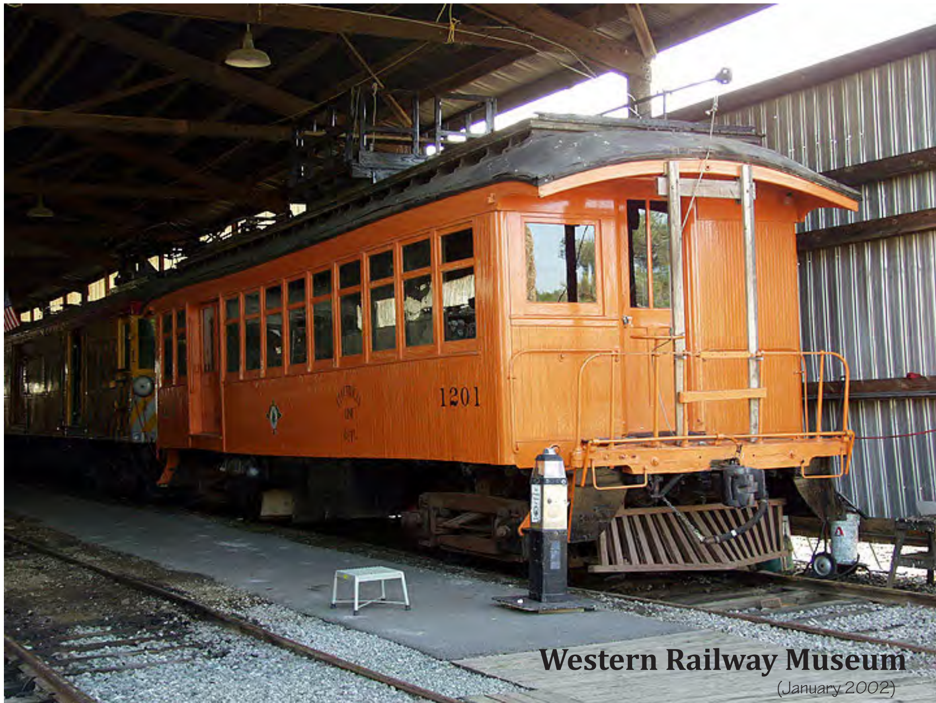
Western Railway Museum (January 2002)