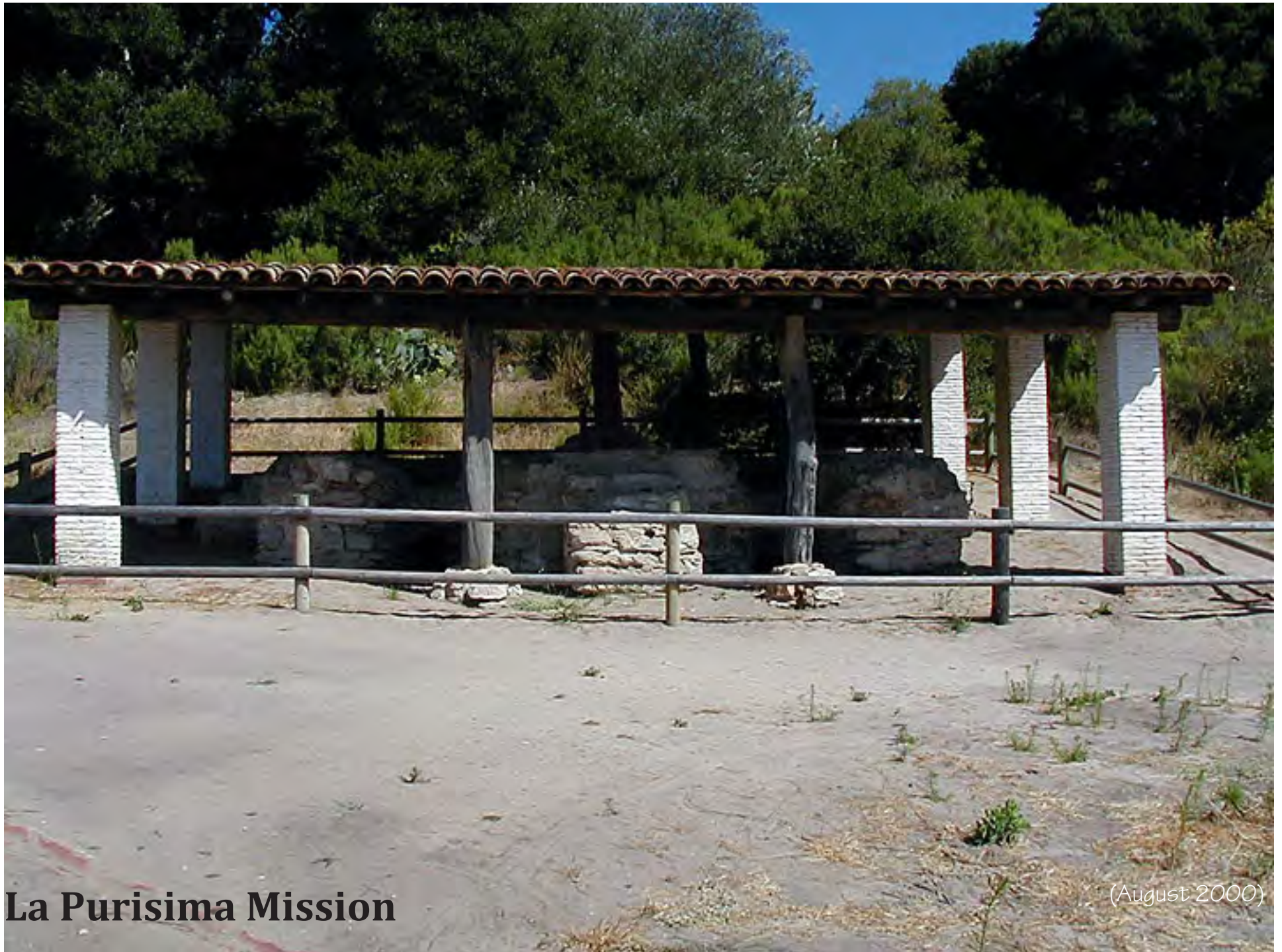
La Purisima Mission