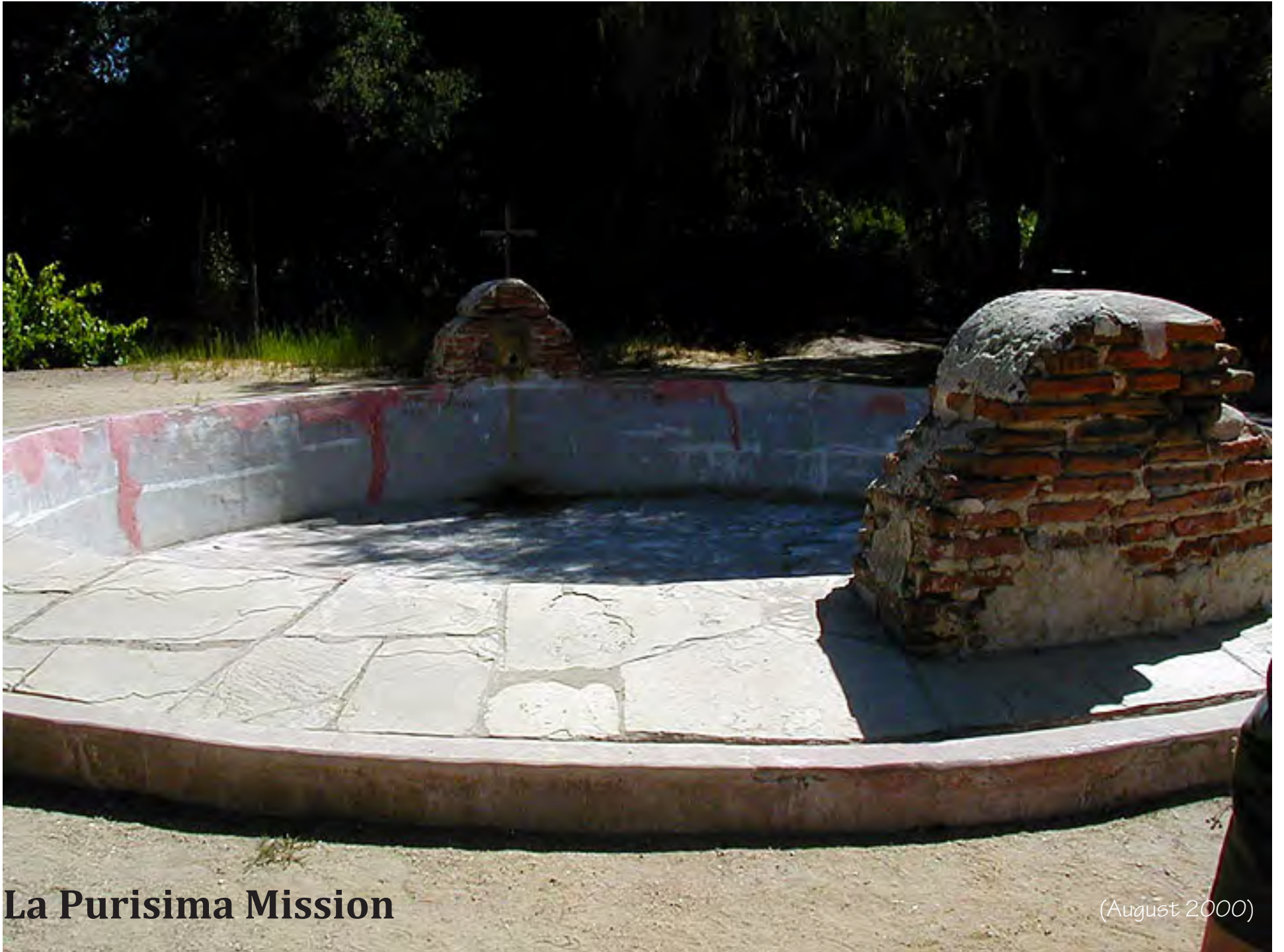
La Purisima Mission