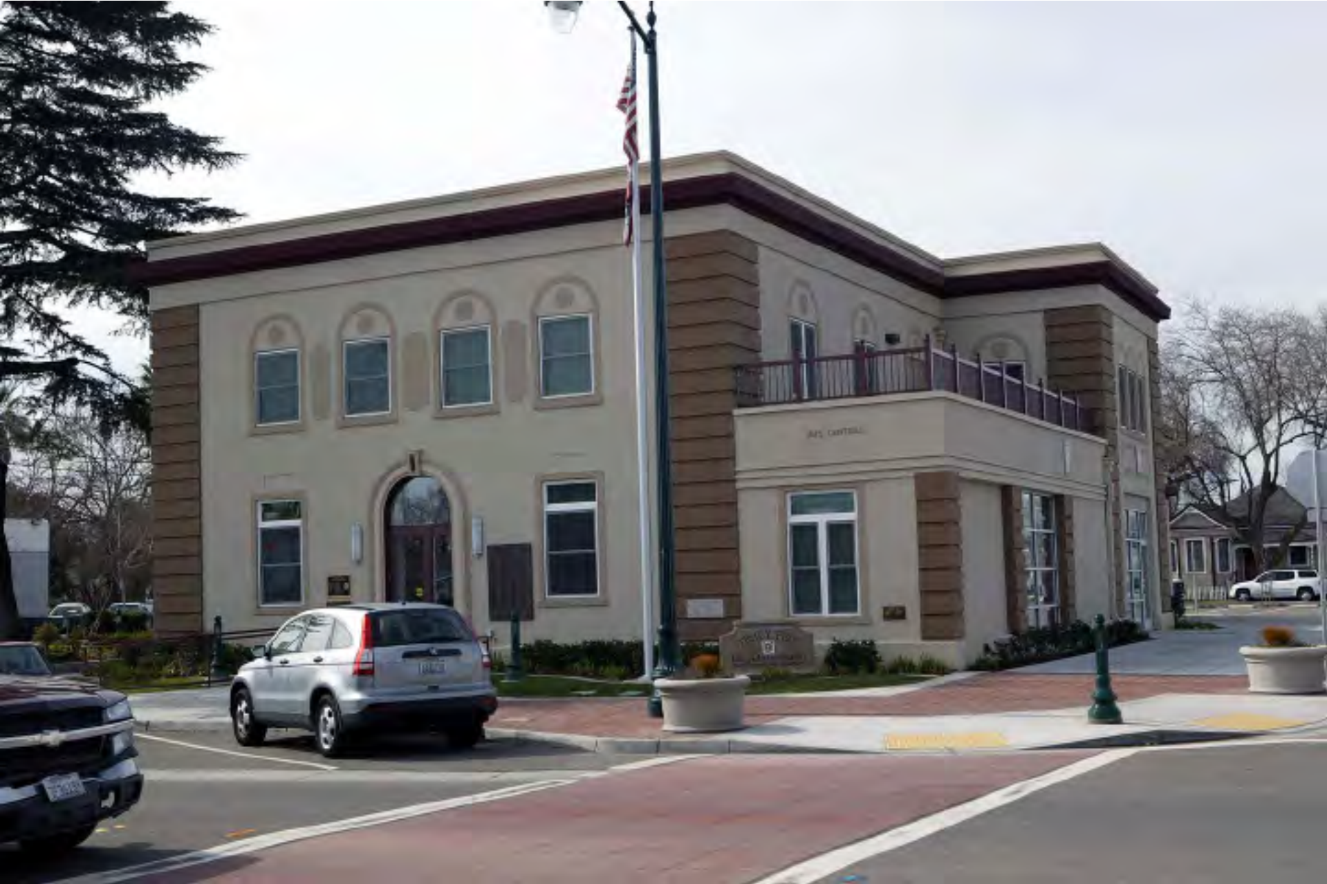
Fire Department Headquarters. (February 2009)