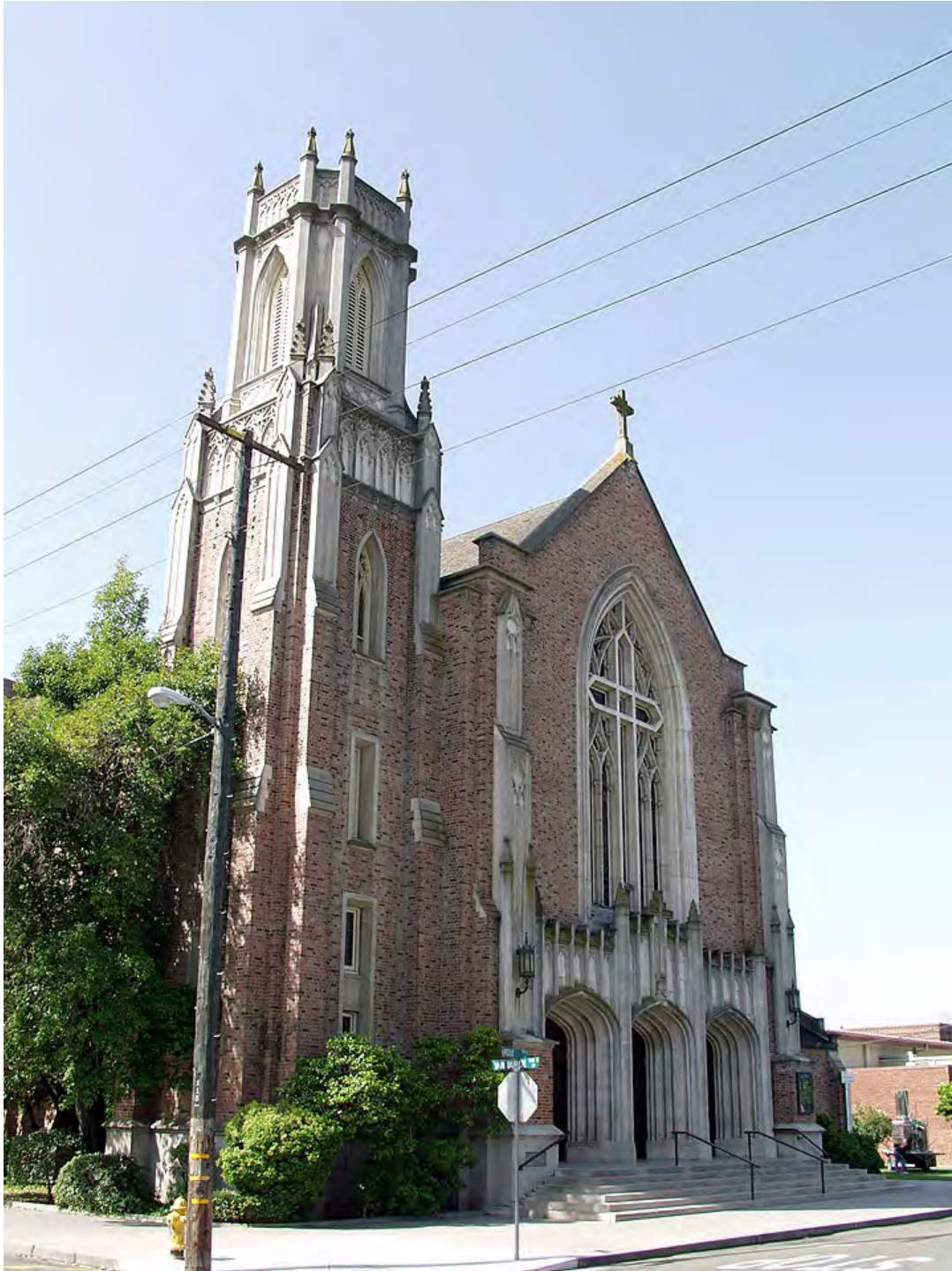
Annunciation Cathedral Rose and Van Buren Streets