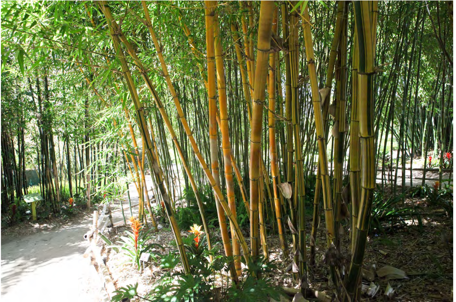
Painted bamboo. The stripes are different on each segment of a pole. The poles will grow to about 50 feet in height.