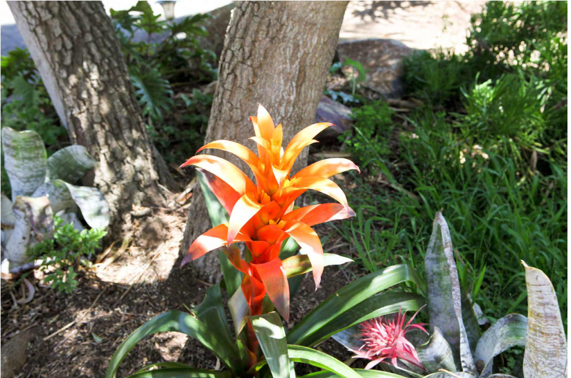
The garden covers 37 acres and includes 3,000 species.