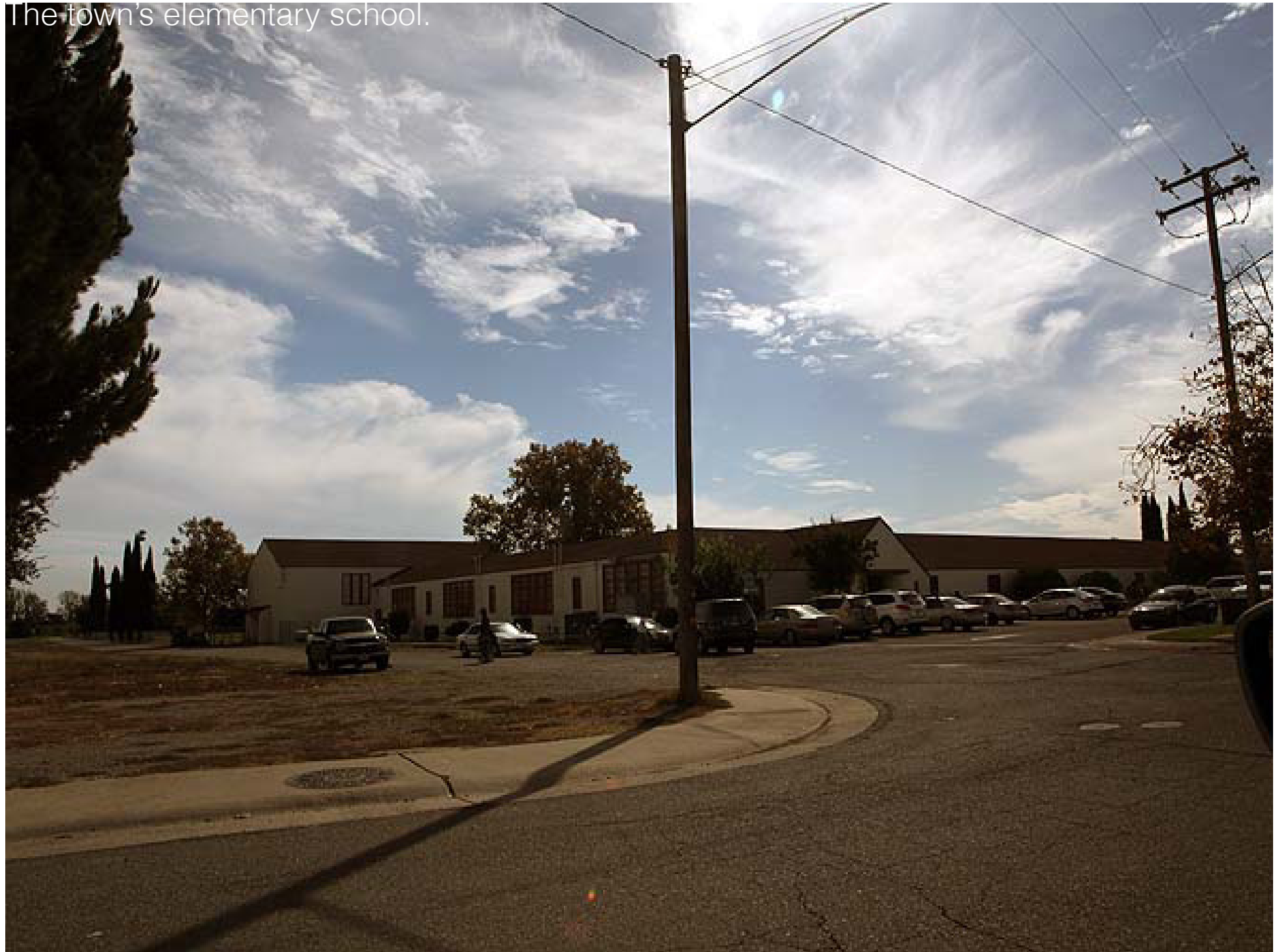
The town's elementary school.