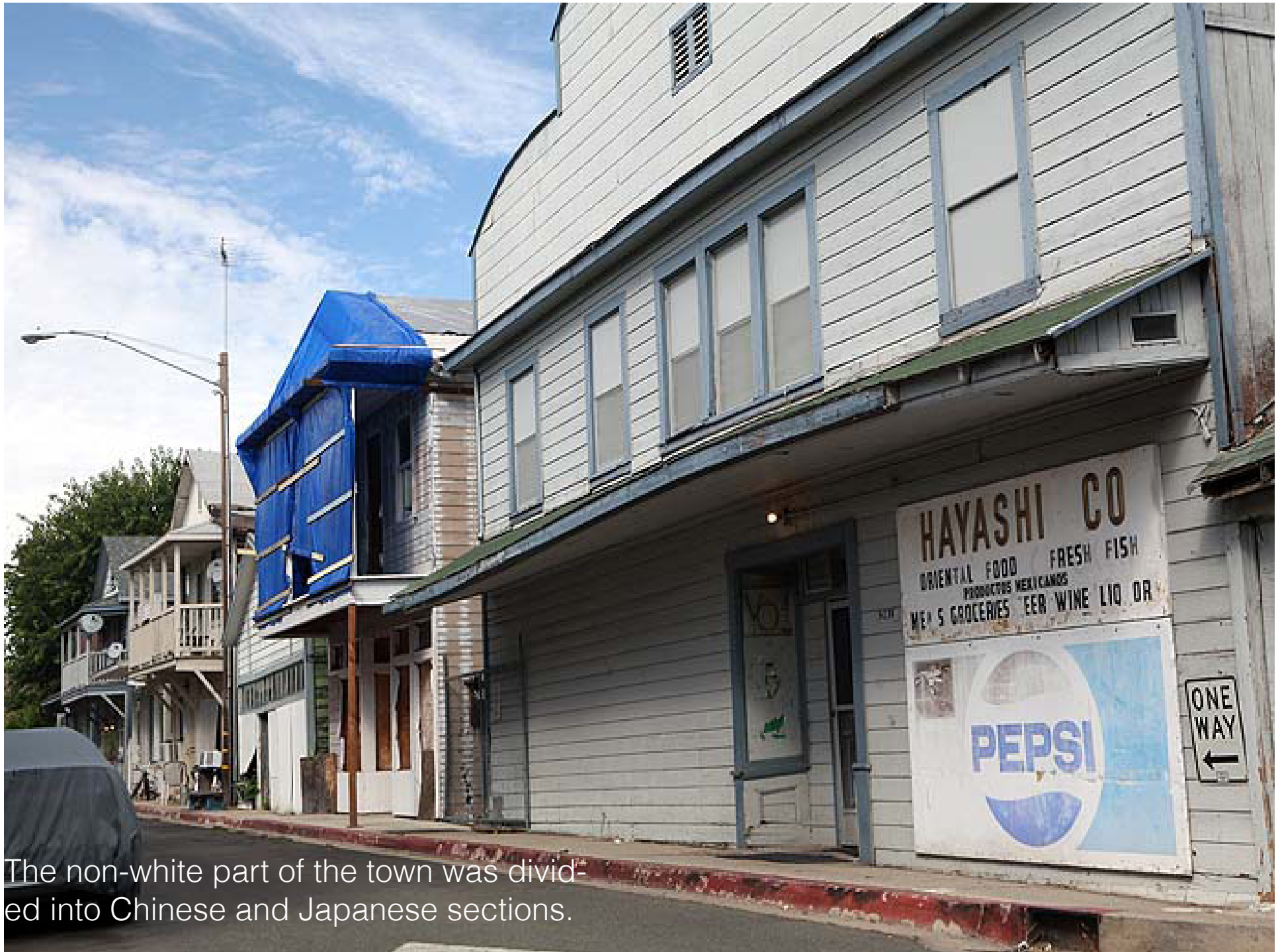
The non-white part of the town was divided into Chinese and Japanese sections.