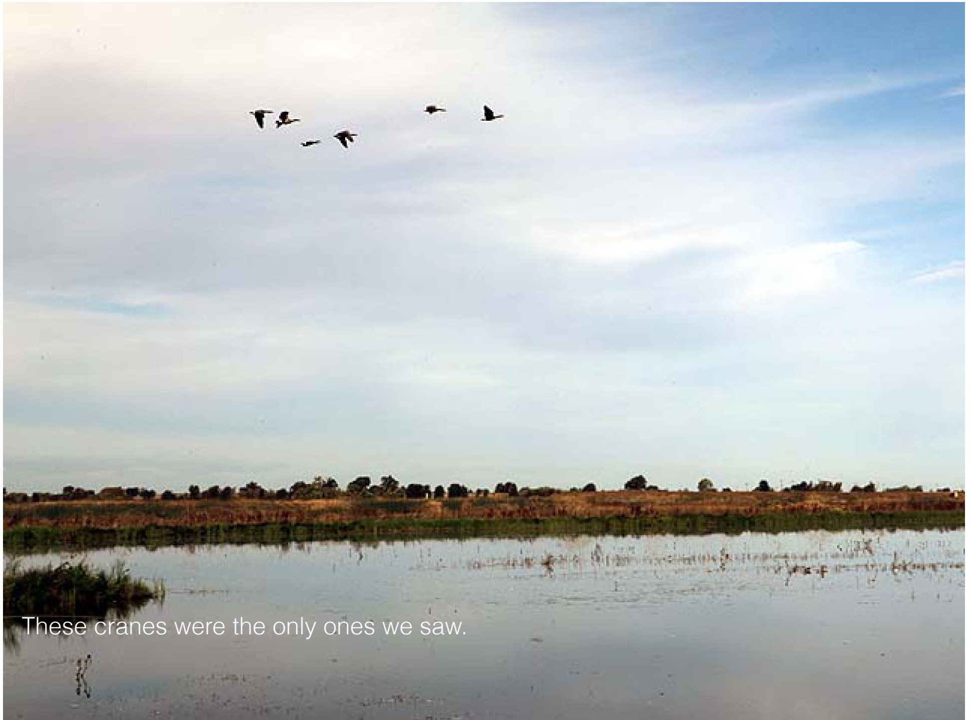
These cranes were the only ones we saw.