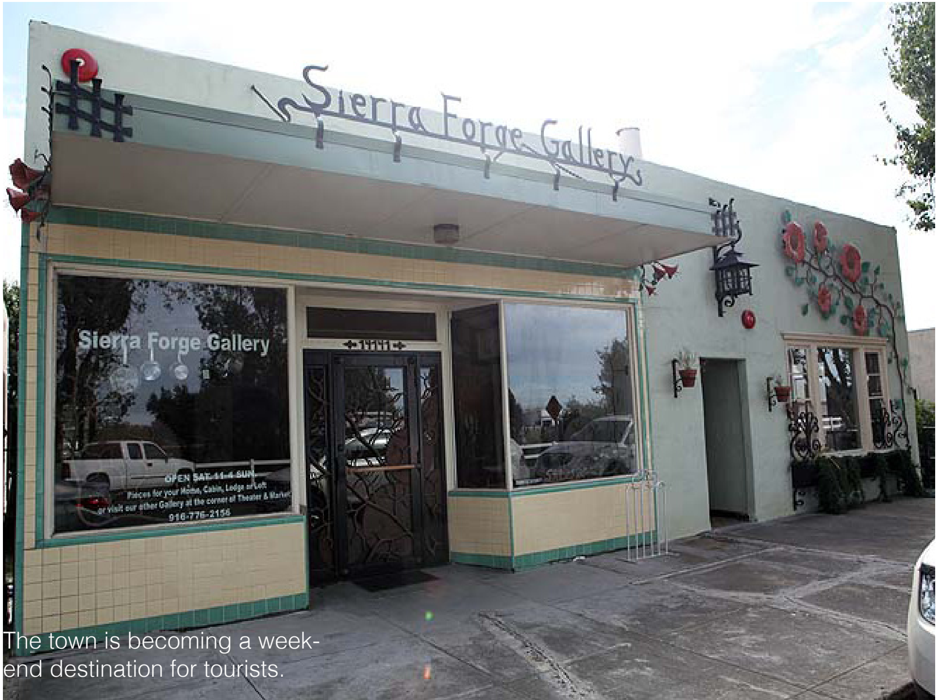
The town is becoming a week-end destination for tourists.