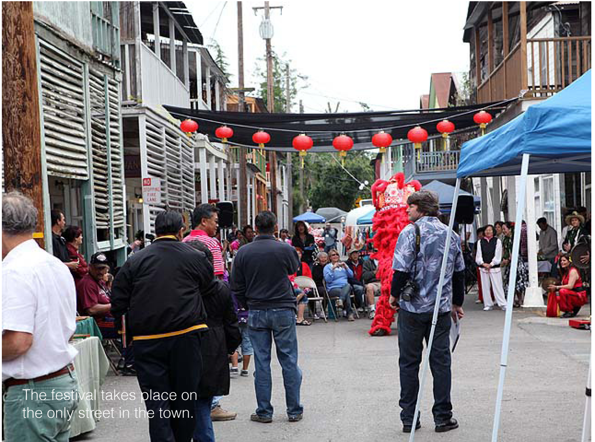
The festival takes place on the only street in the town.