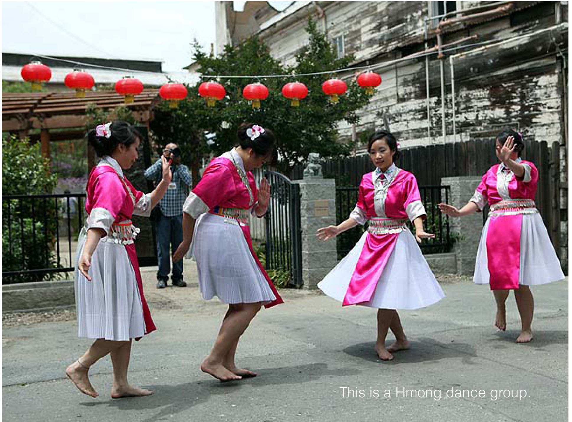
This is a Hmong dance group.