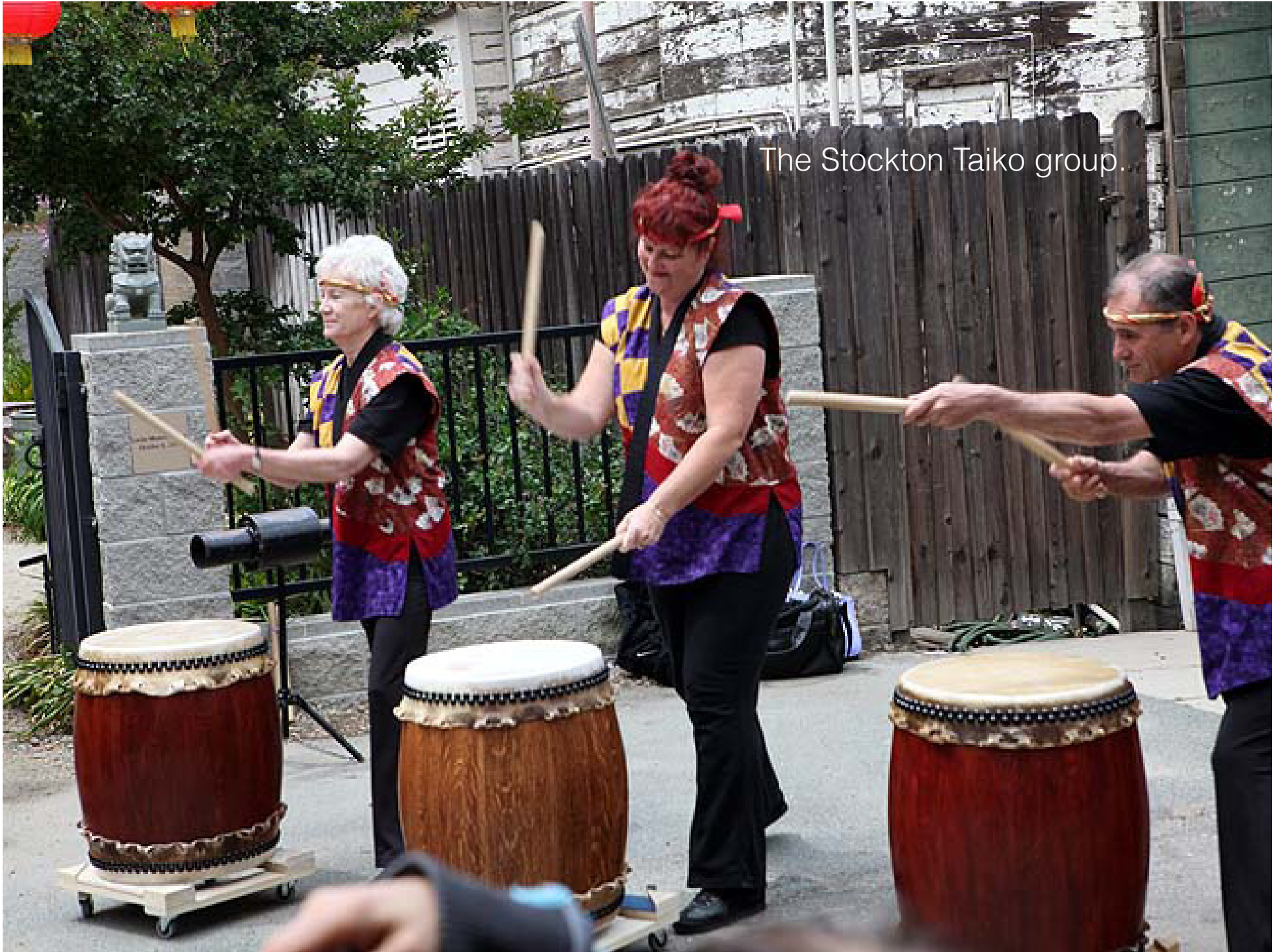
The Stockton Taiko group.