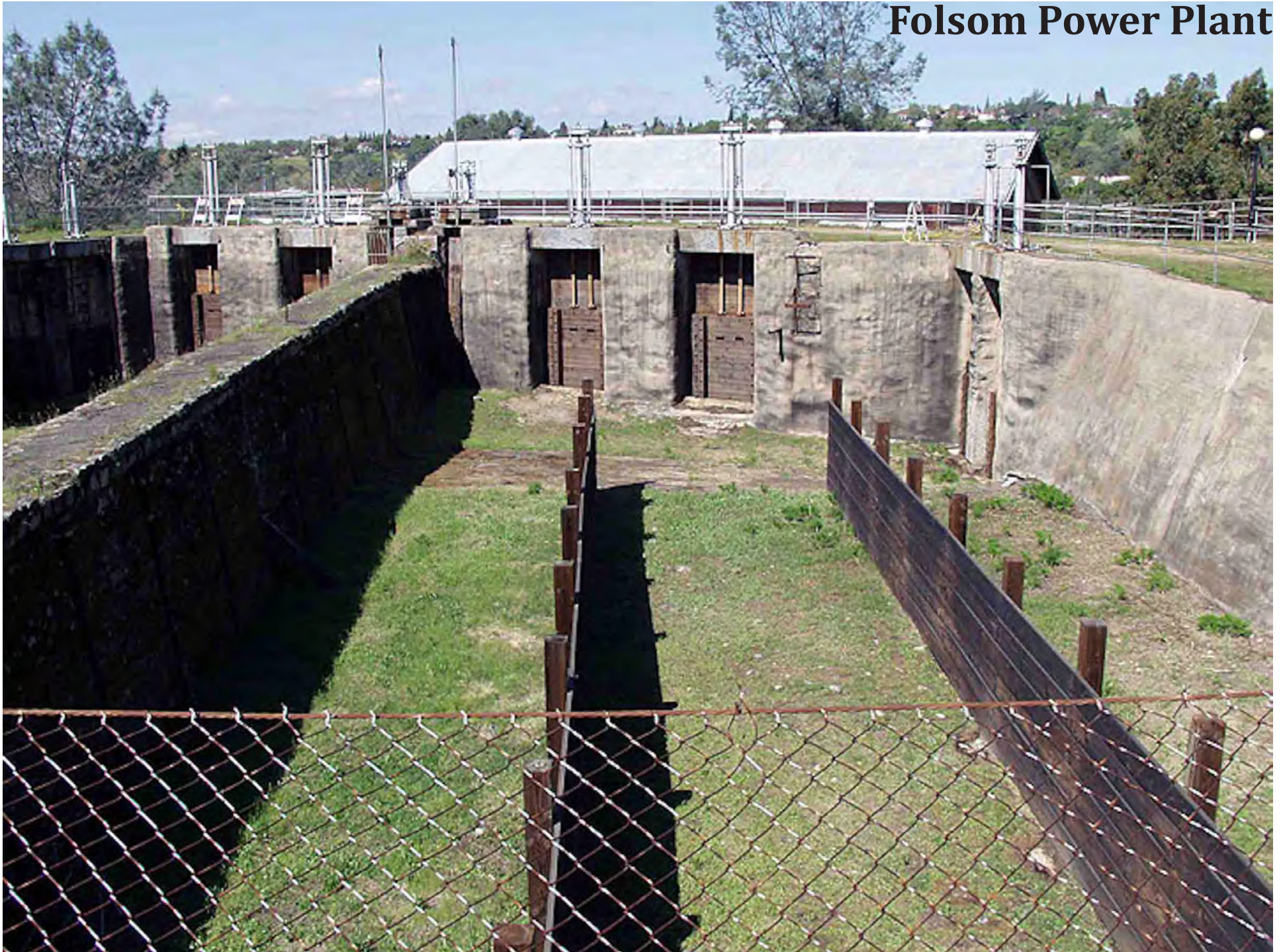
Folsom Power Plant