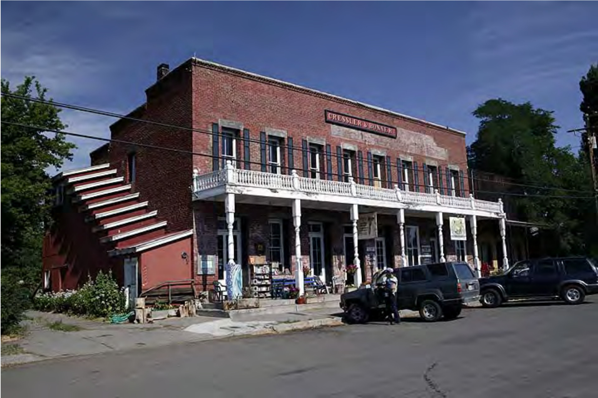
The Cressler & Bonner general store on the main street. (July 2006)