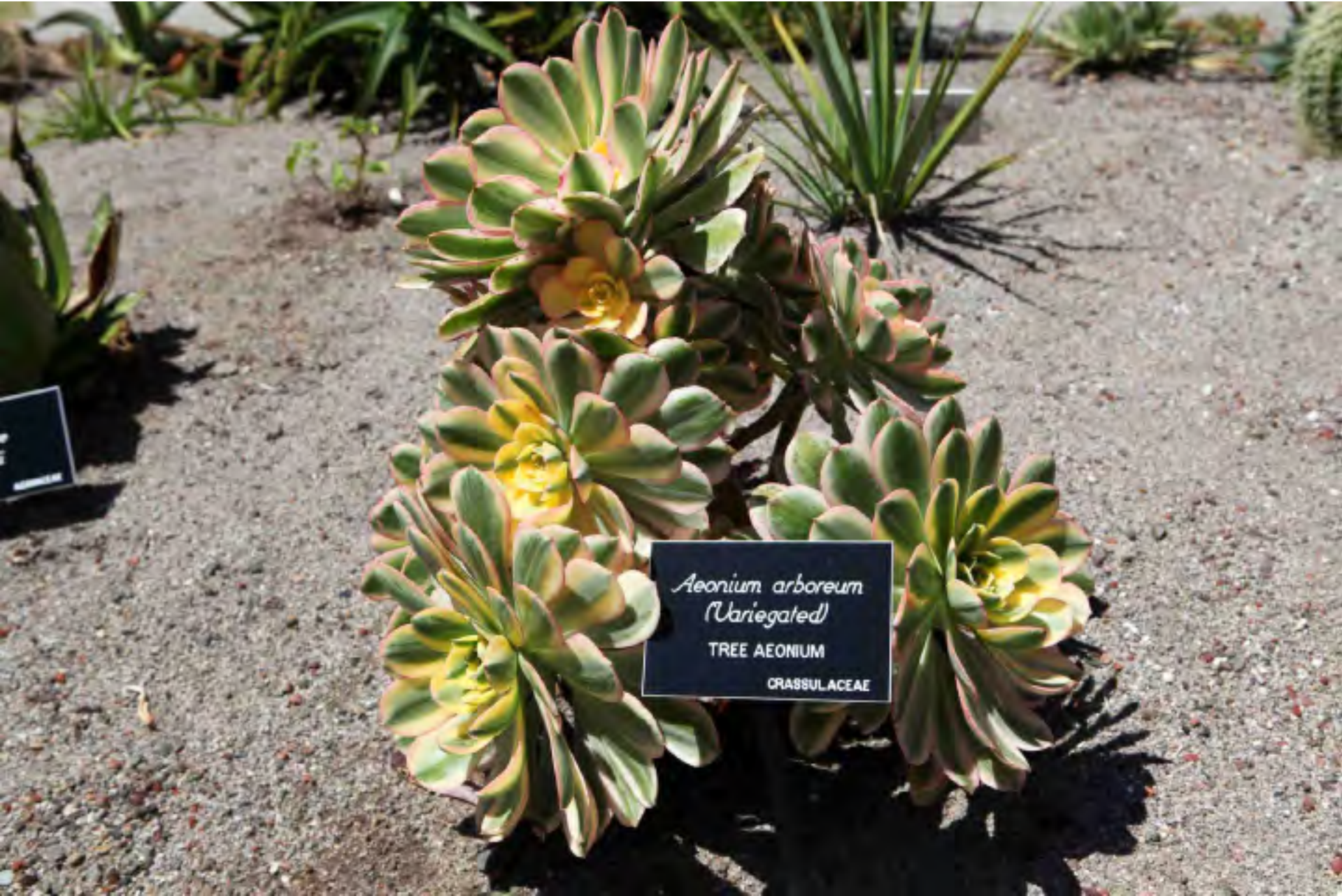
Aeonium arboreum (Variegated) TREE AEONIUM CRASSULACEAE