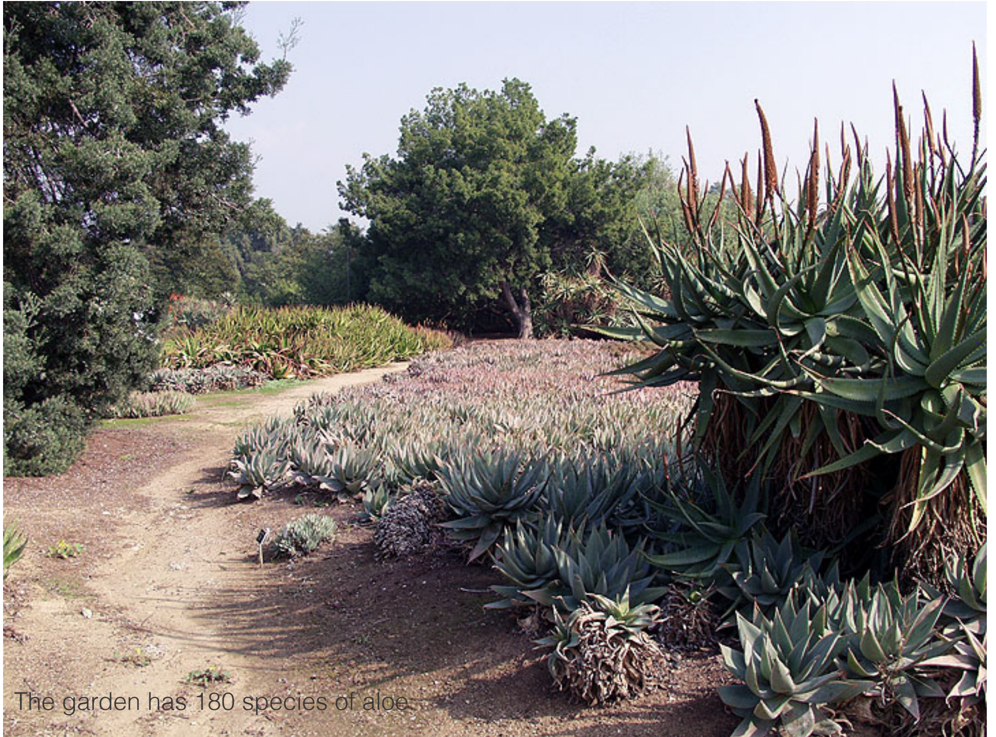
The garden has 180 species of aloe.