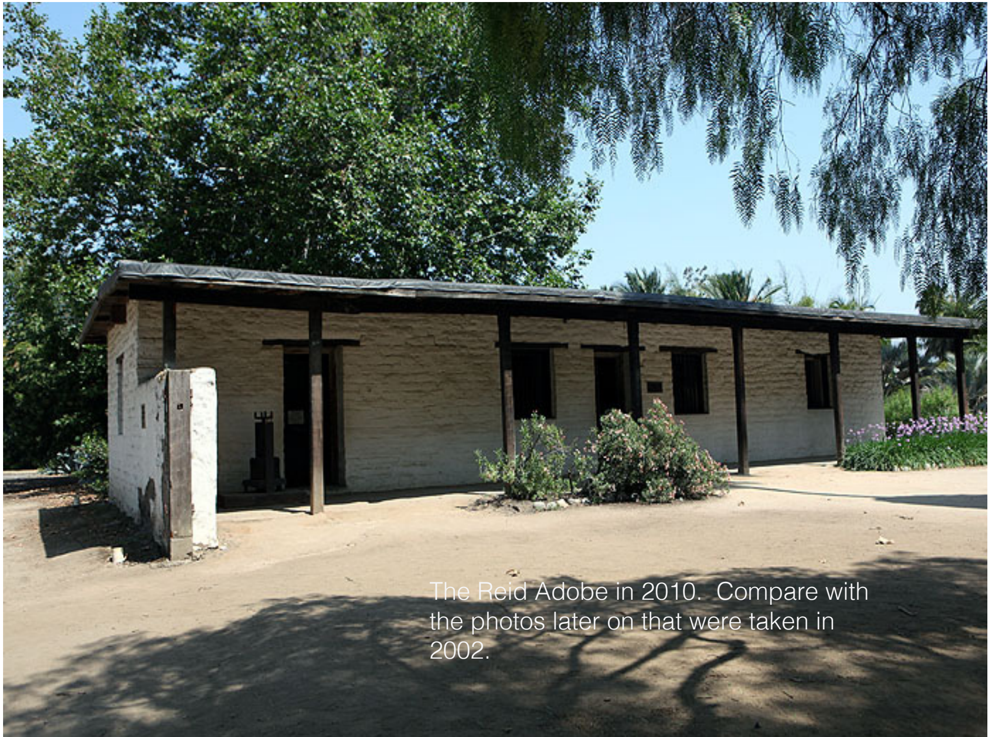
The Reid Adobe in 2010. Compare with the photos later on that were taken in 2002.