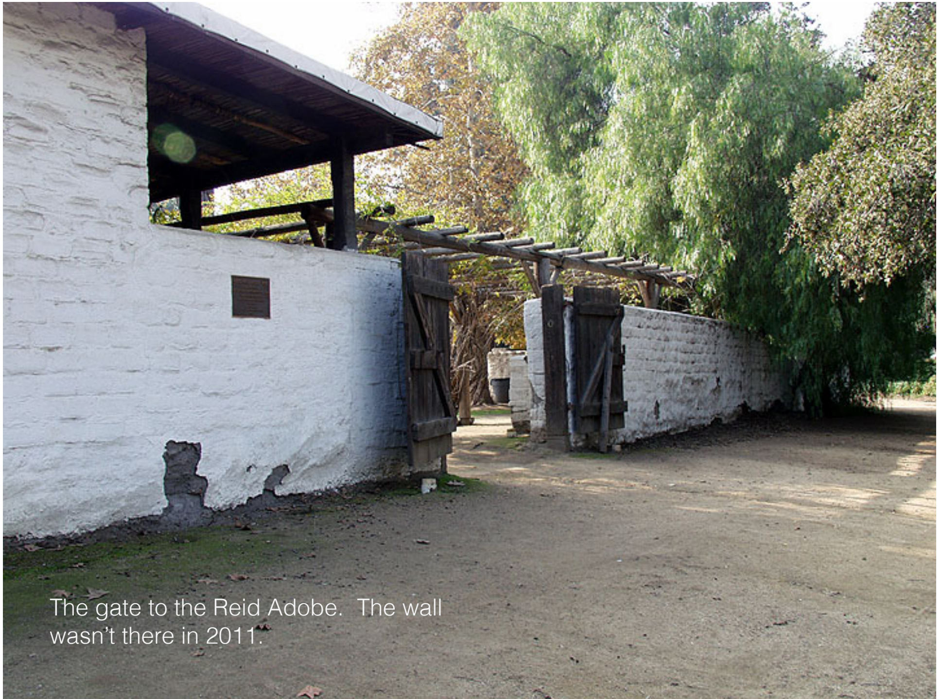
The gate to the Reid Adobe. The wall wasn't there in 2011.