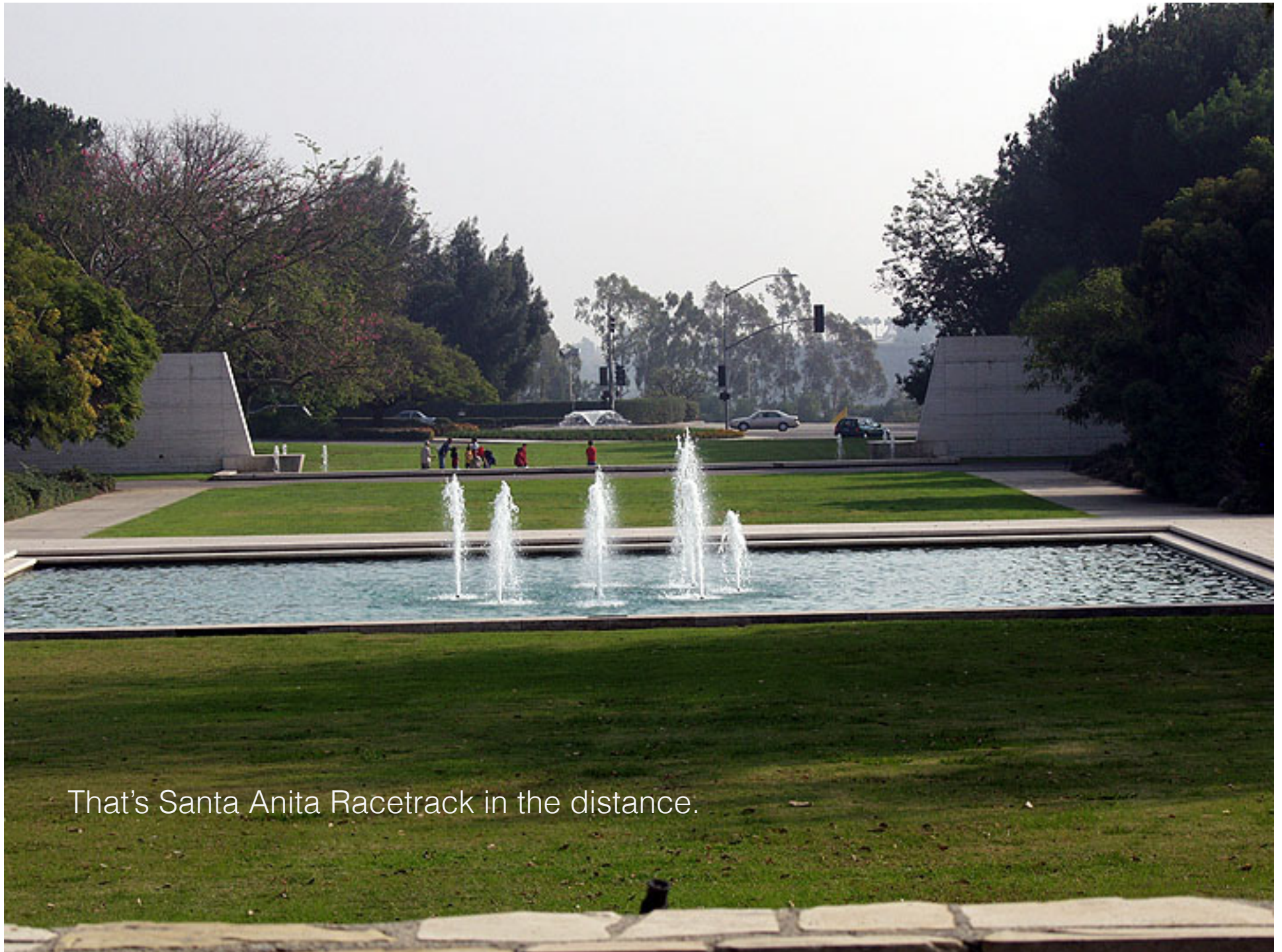
That's Santa Anita Racetrack in the distance.