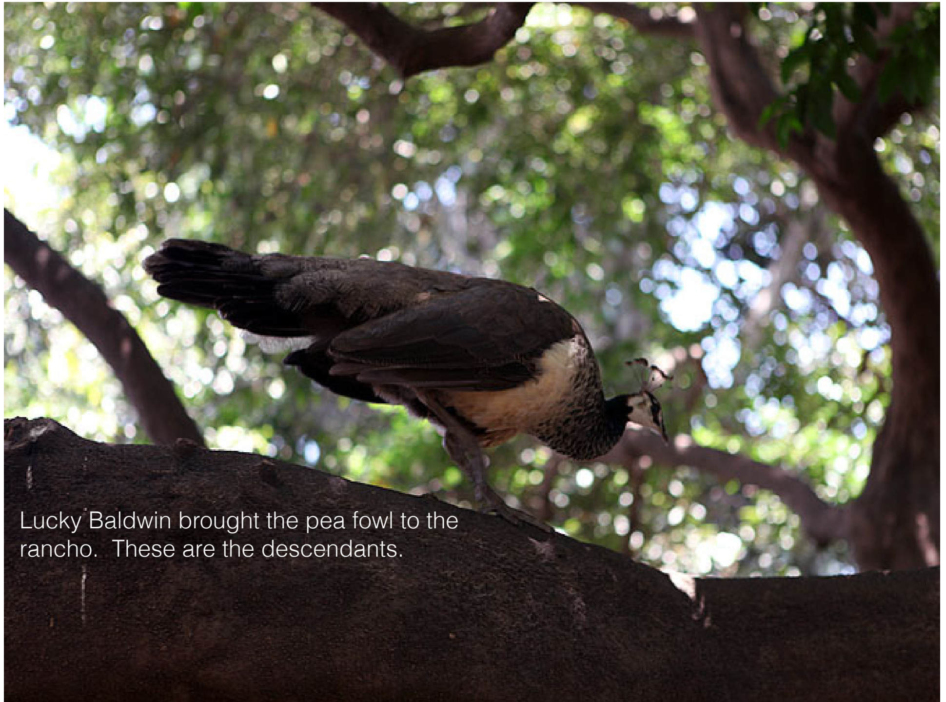
Lucky Baldwin brought the pea fowl to the rancho. These are the descendants.