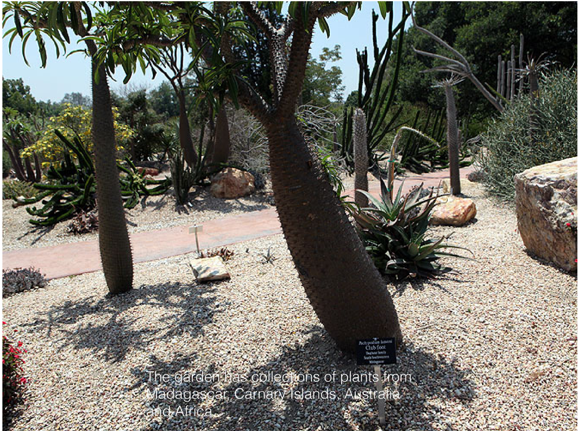
The garden has collections of plants from Madagascar, Canary Islands, Australia and Africa.