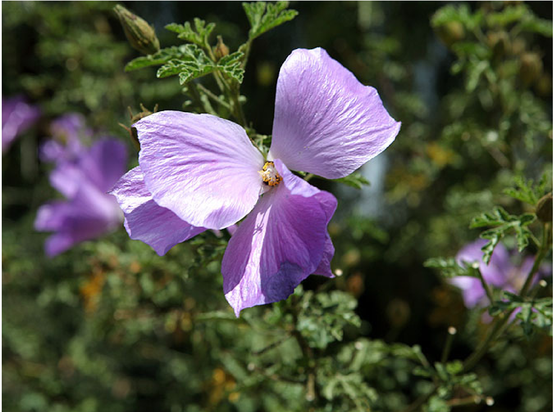
The Modoc County Courthouse in Alturas.