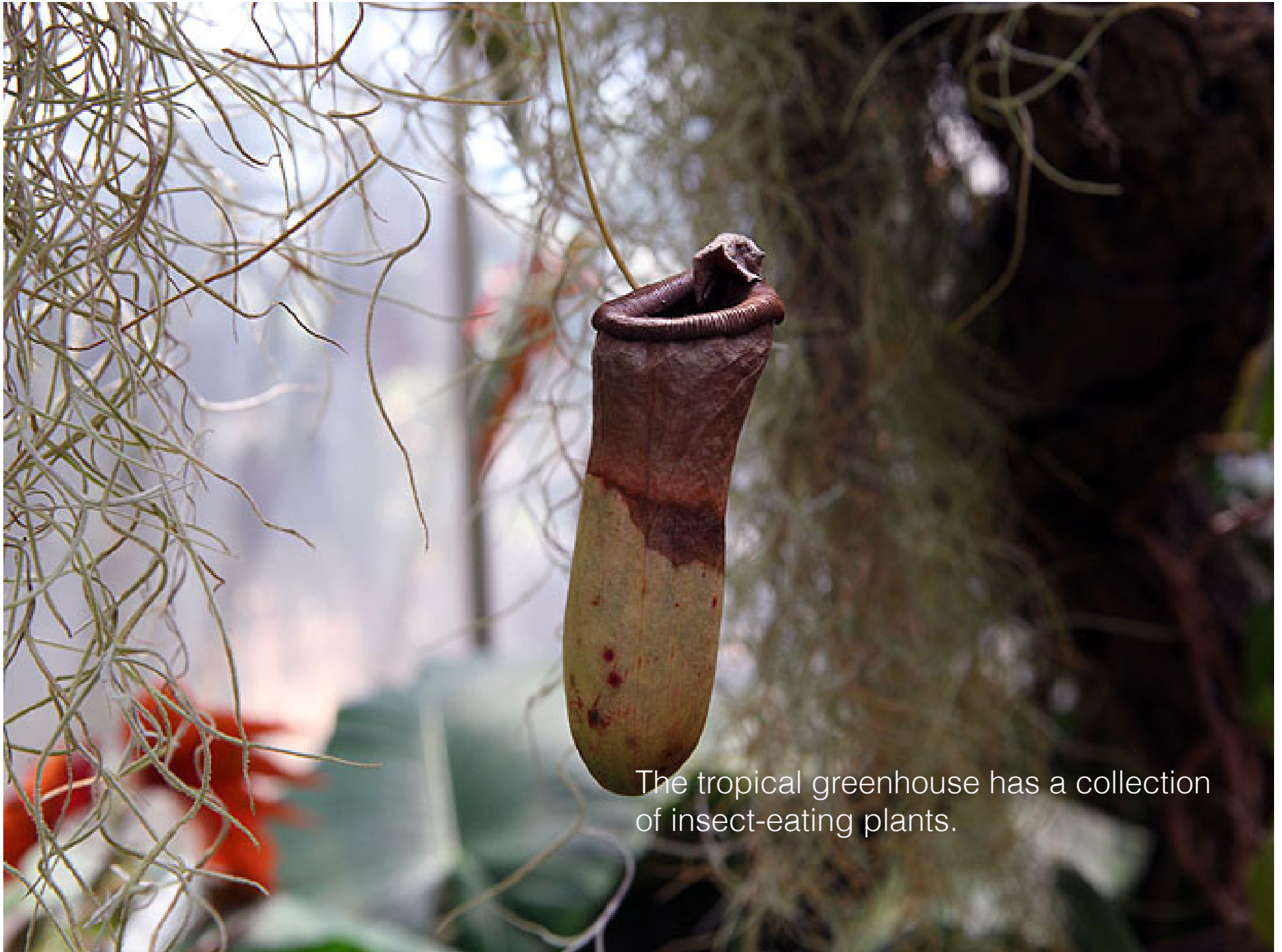
The tropical greenhouse has a collection of insect-eating plants.