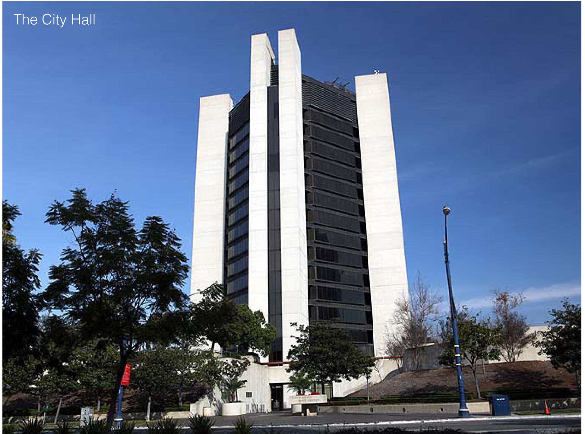
The City Hall