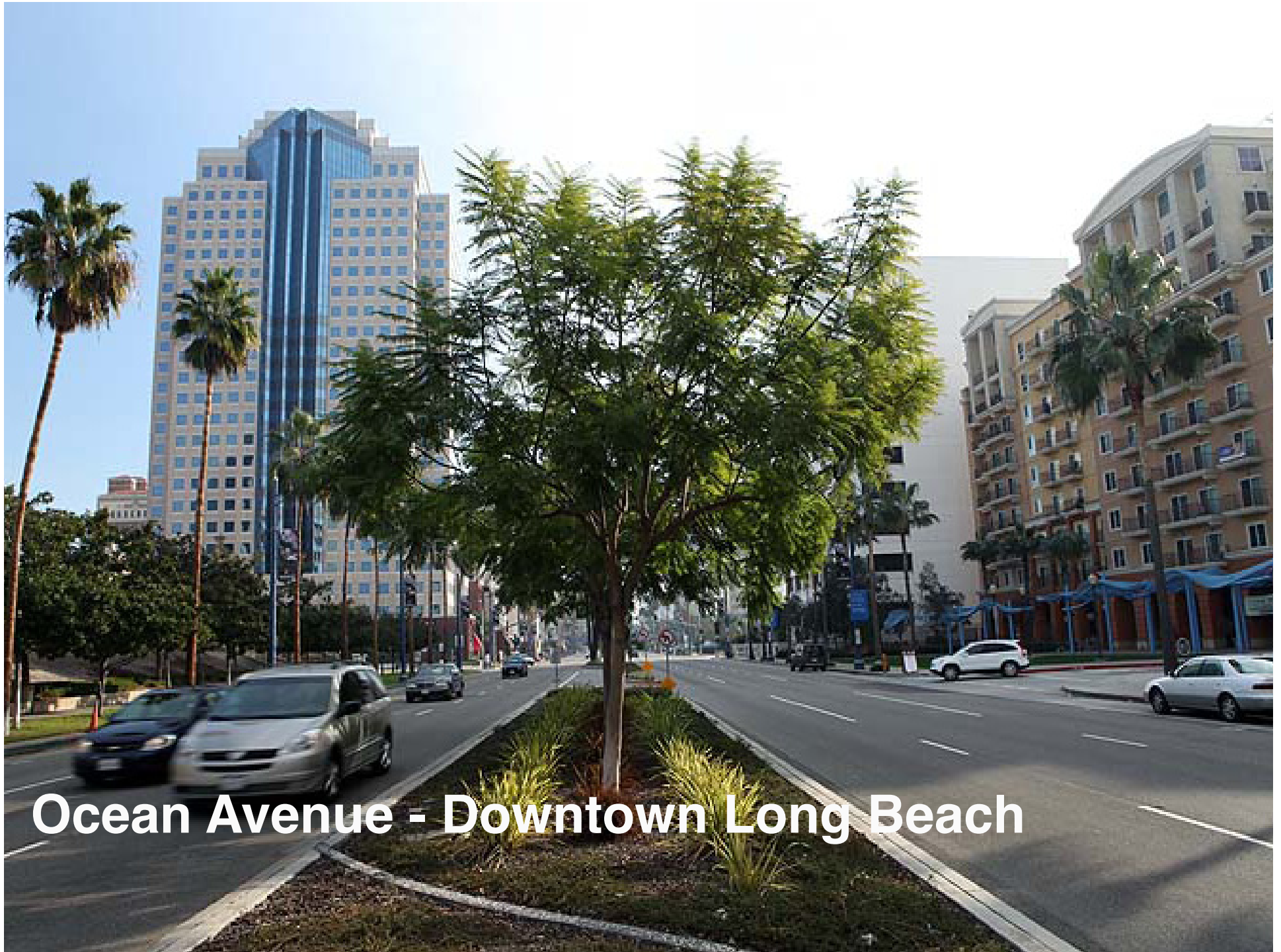
Ocean Avenue - Downtown Long Beach