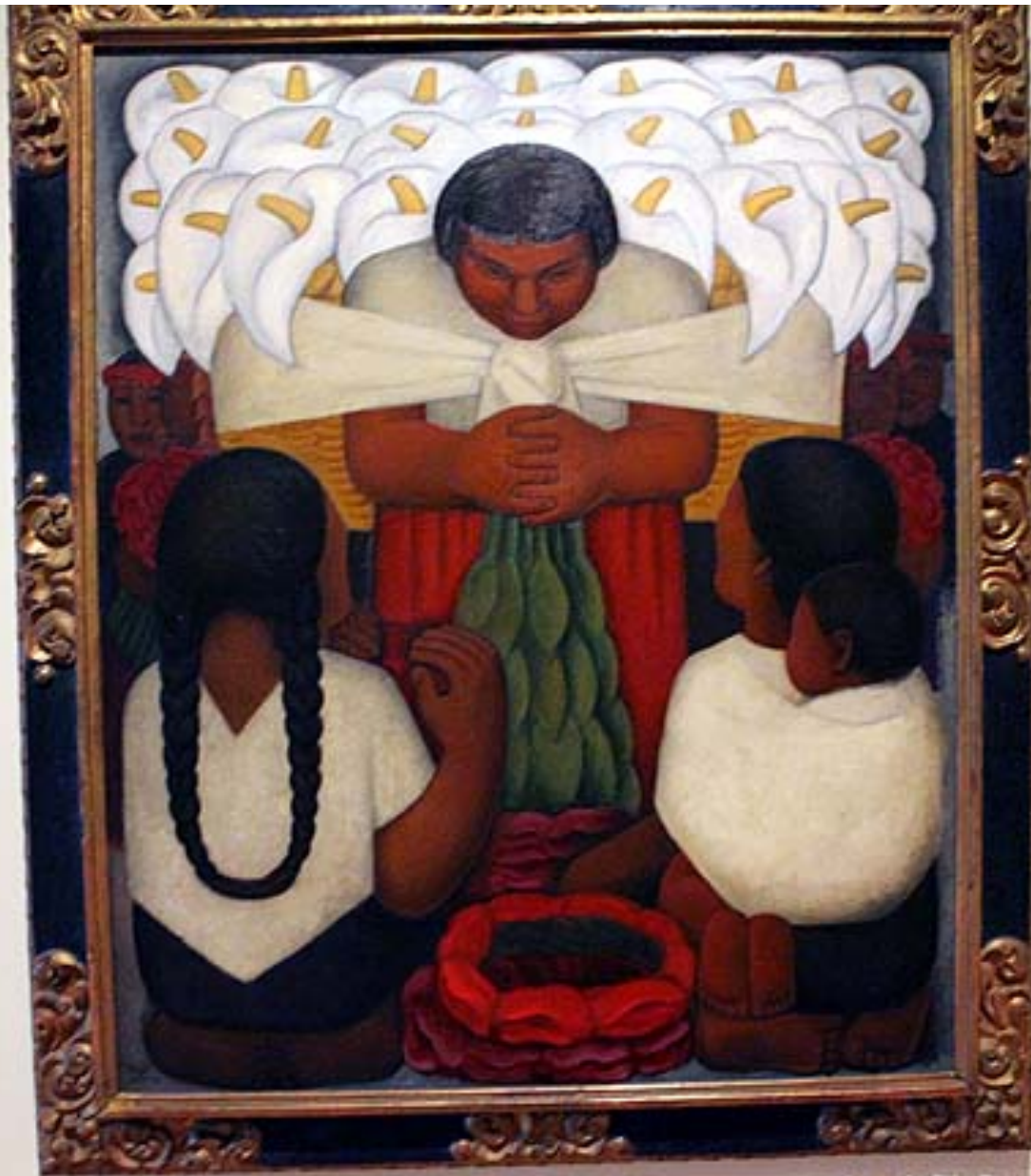
FRIDA KAHLO THE FAMILY REUNION 1930 OIL ON CANVAS 100 x 130 cm MUSEUM OF MODERN ART, NEW YORK