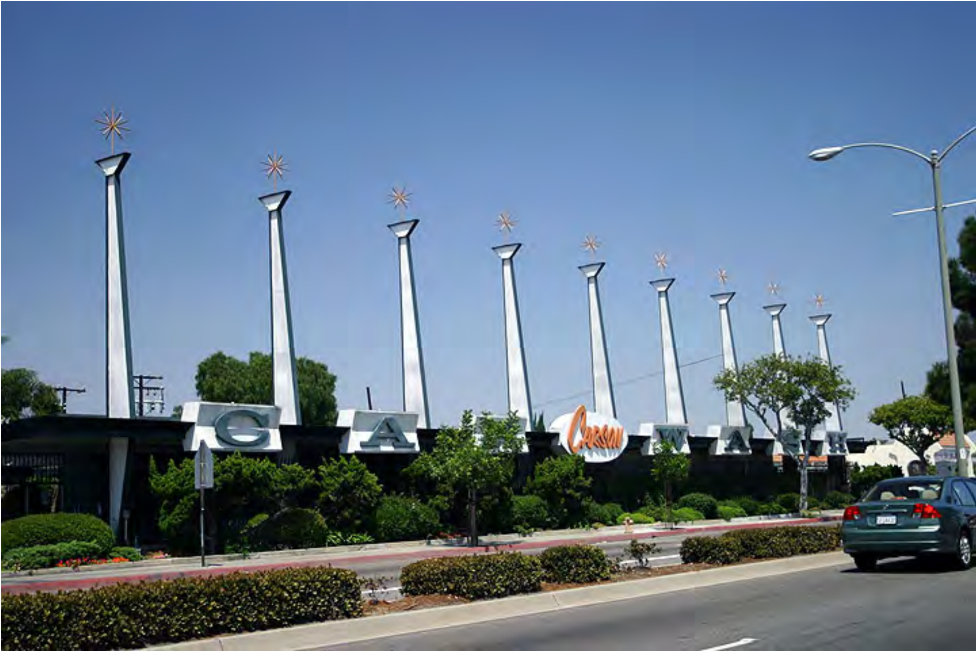
A classic Googie car wash.