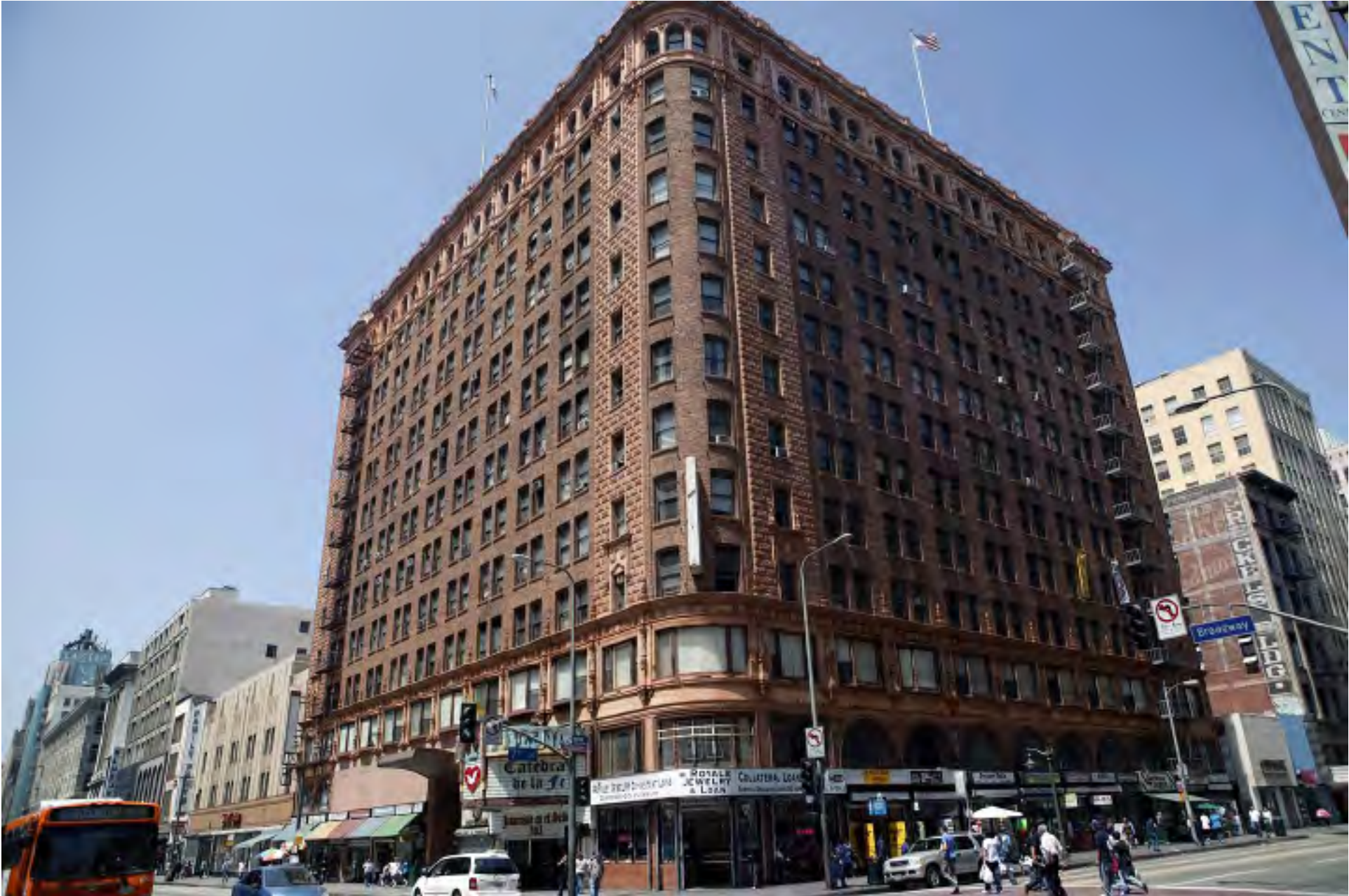
The State Theatre. The theatres were built inside office buildings. (May 2009)