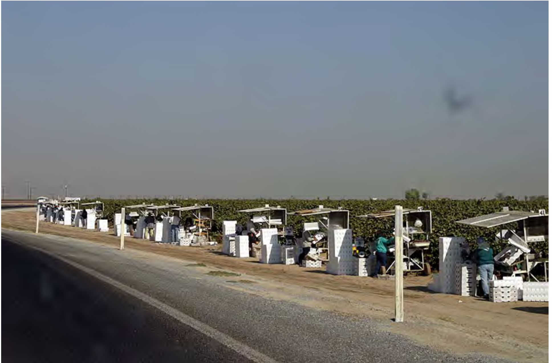
Table grapes are picked by hand. Wine grapes are usually picked by machine. (October 2003)