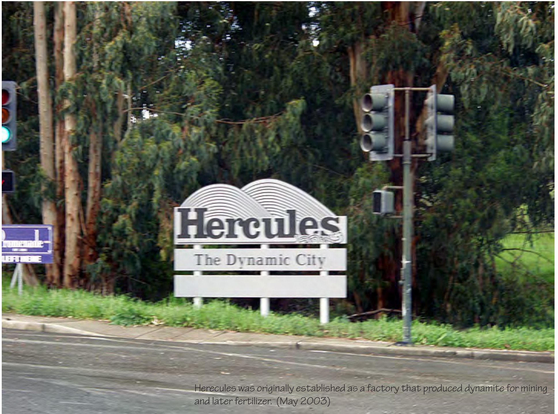
Hercules was originally established as a factory that produced dynamite for mining and later fertilizer. (May 2003)