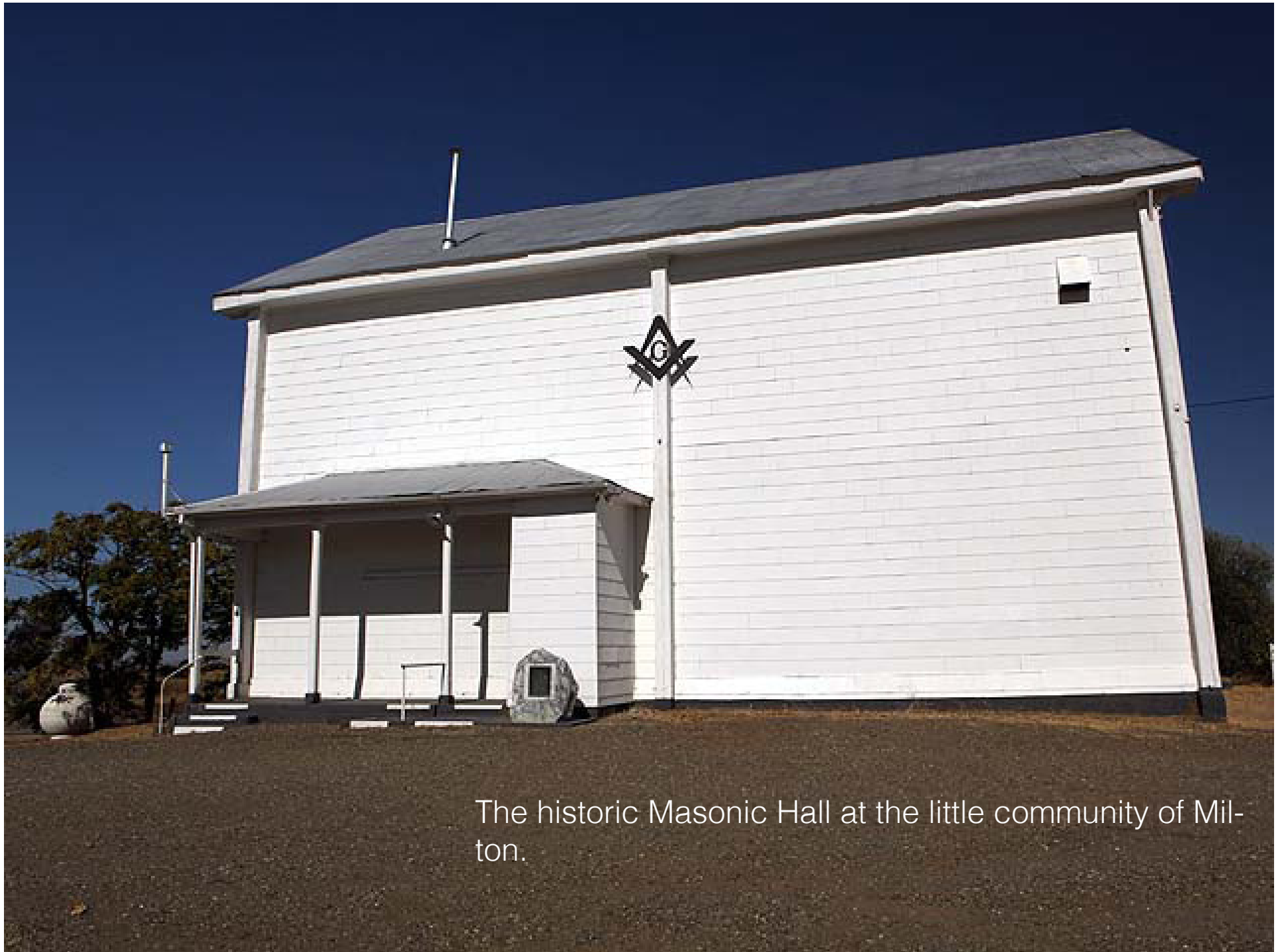
The historic Masonic Hall at the little community of Milton.