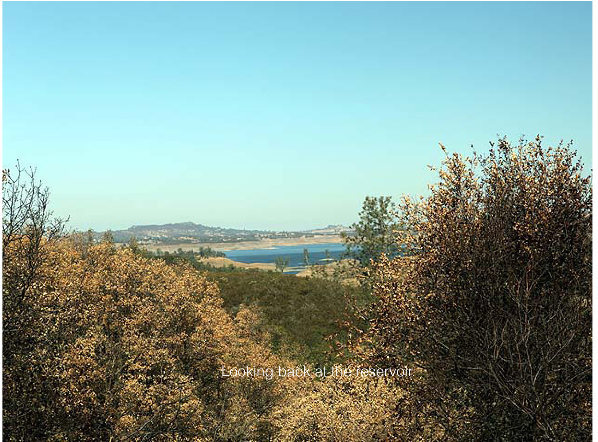
Looking back at the reservoir