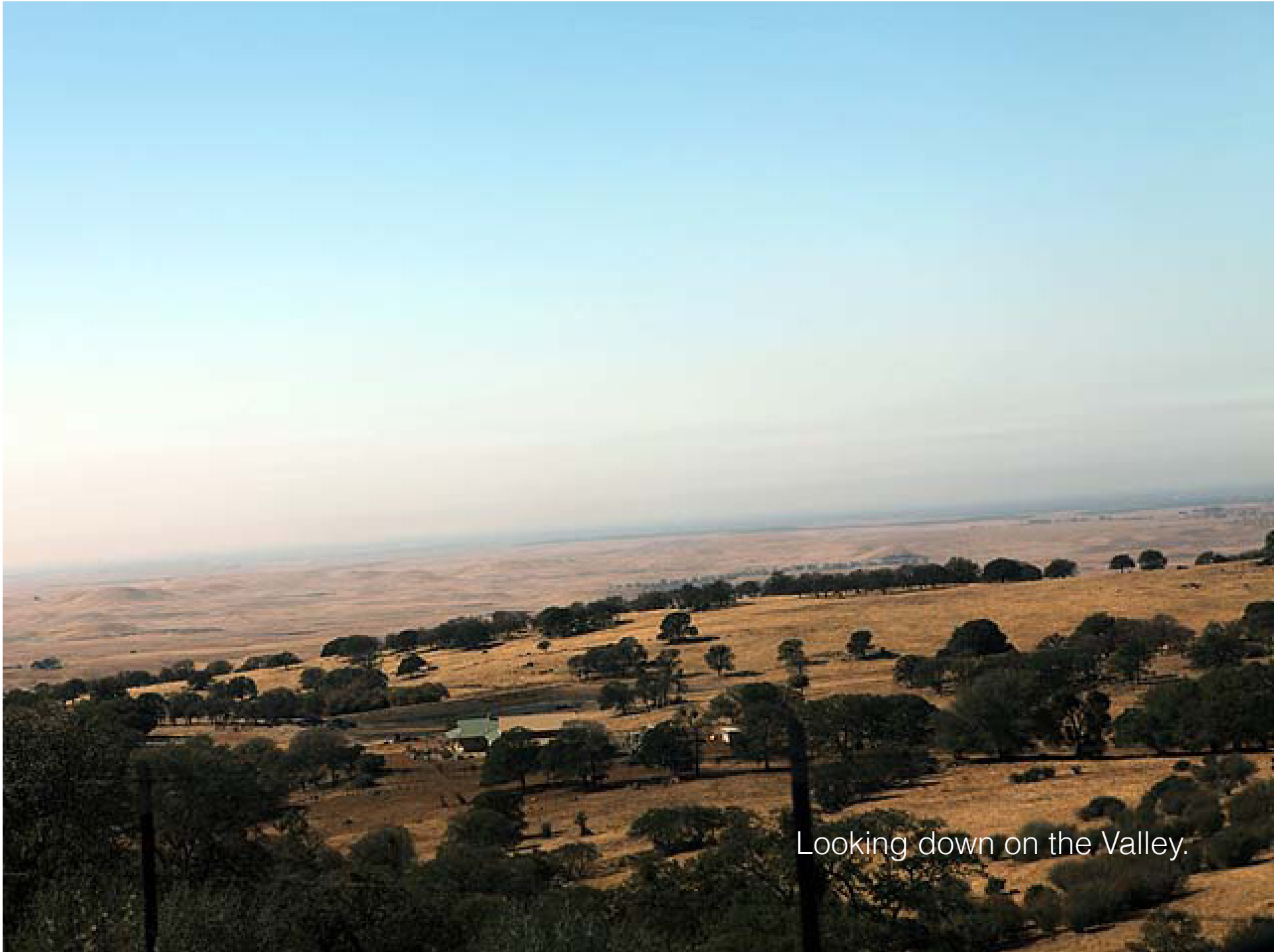
Looking down on the Valley.