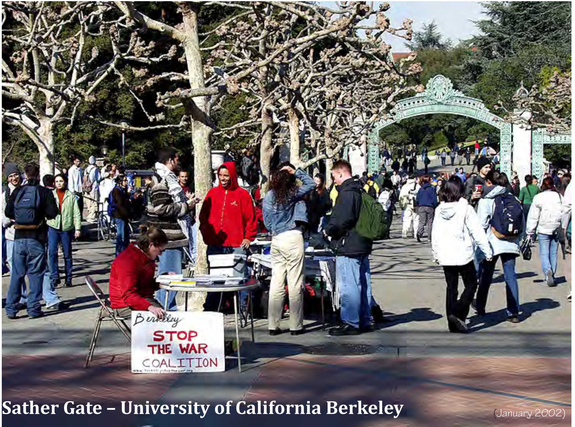
Sather Gate – University of California Berkeley