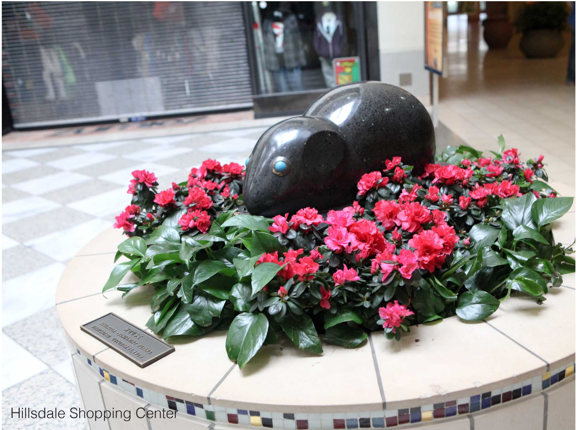
Hillsdale Shopping Center