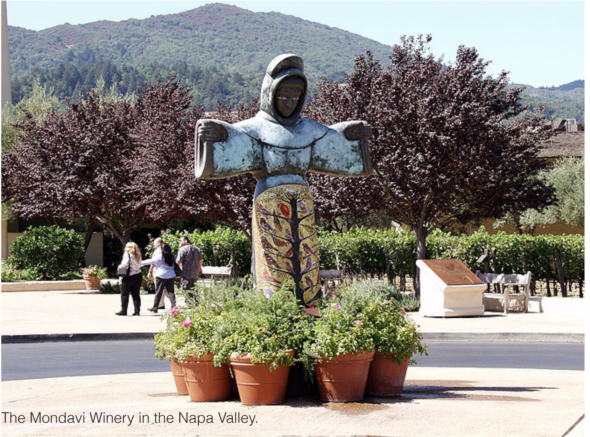
The Mondavi Winery in the Napa Valley.