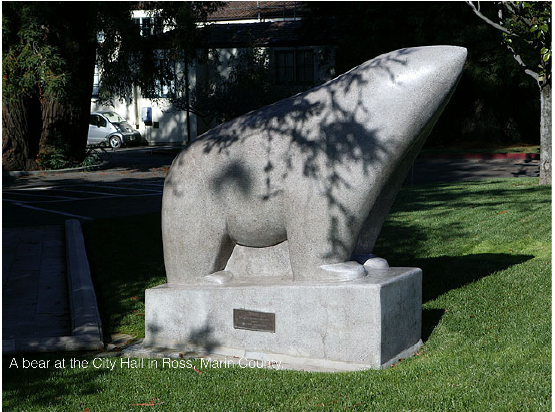
A bear at the City Hall in Ross, Marin County.