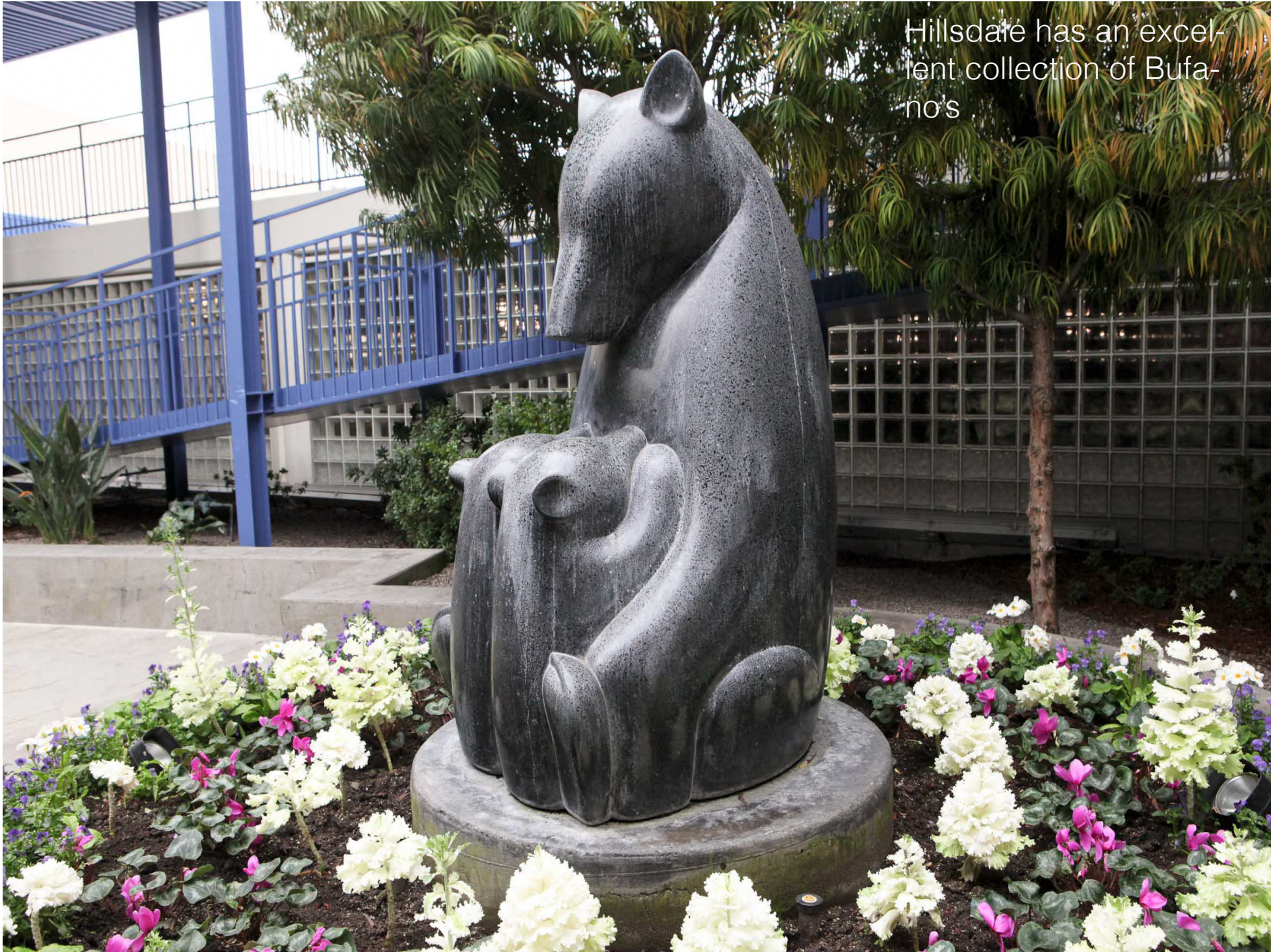
Hillsdale has an excellent collection of Bufano's