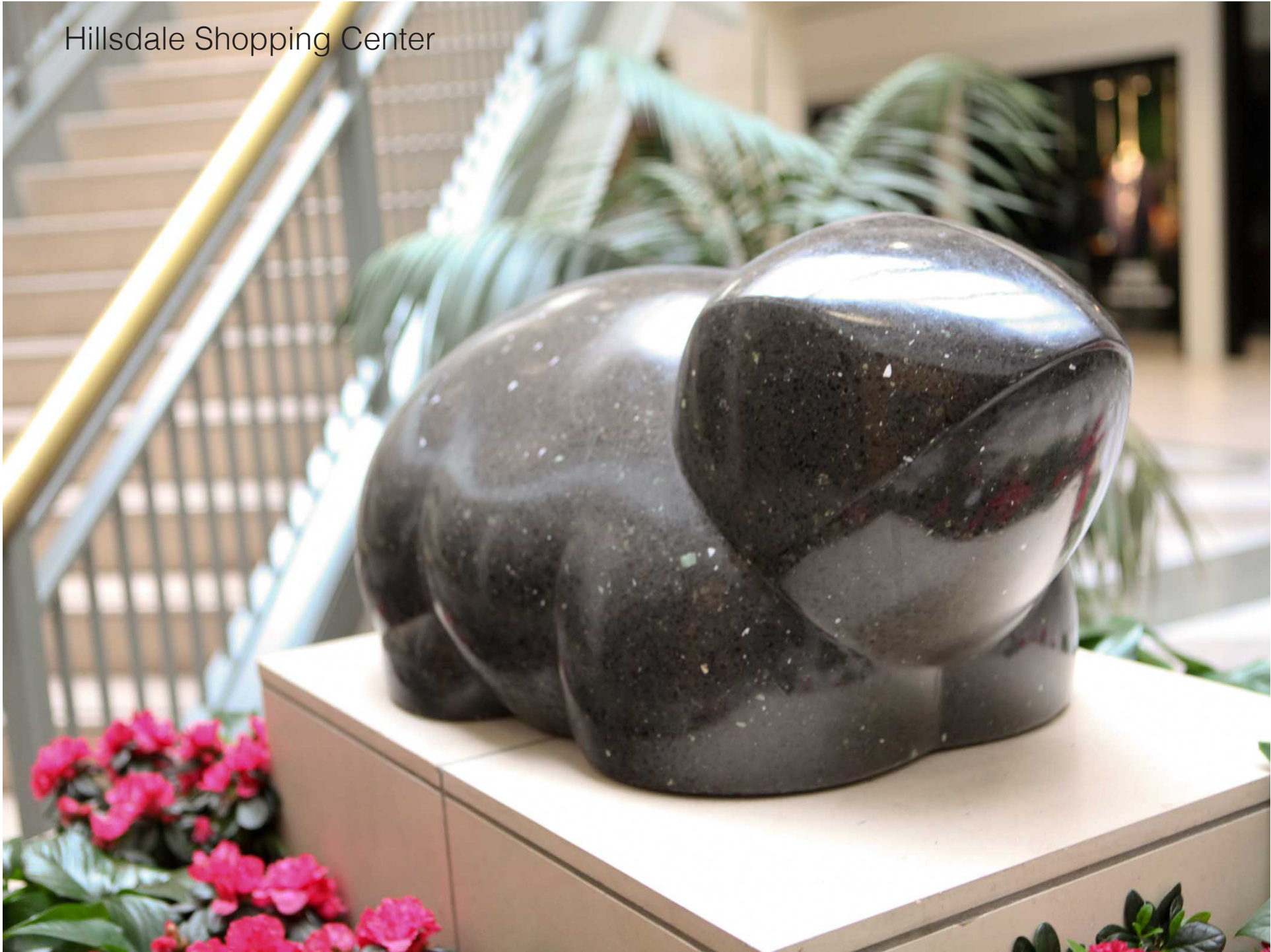
Hillsdale Shopping Center