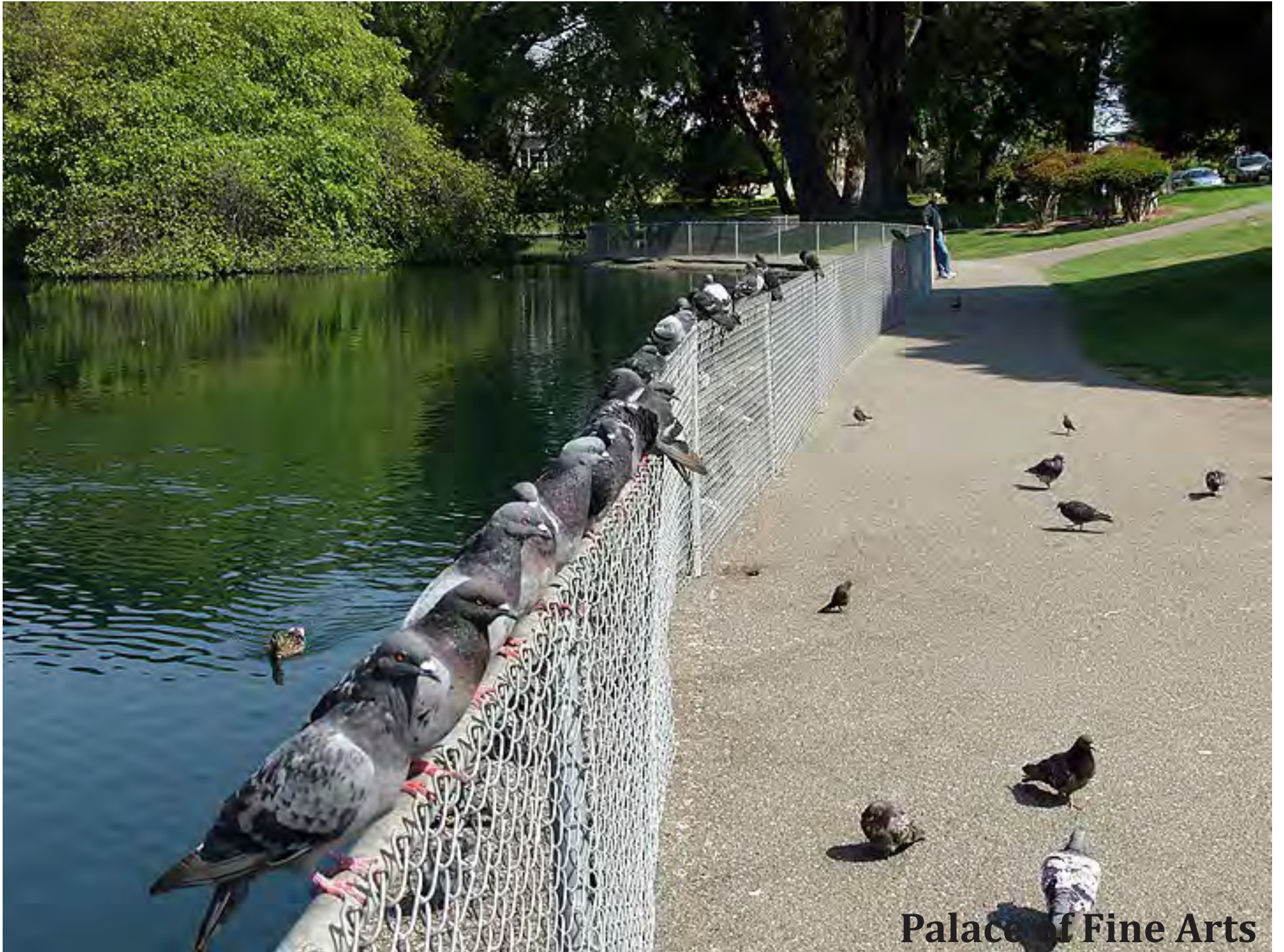
Palace of Fine Arts