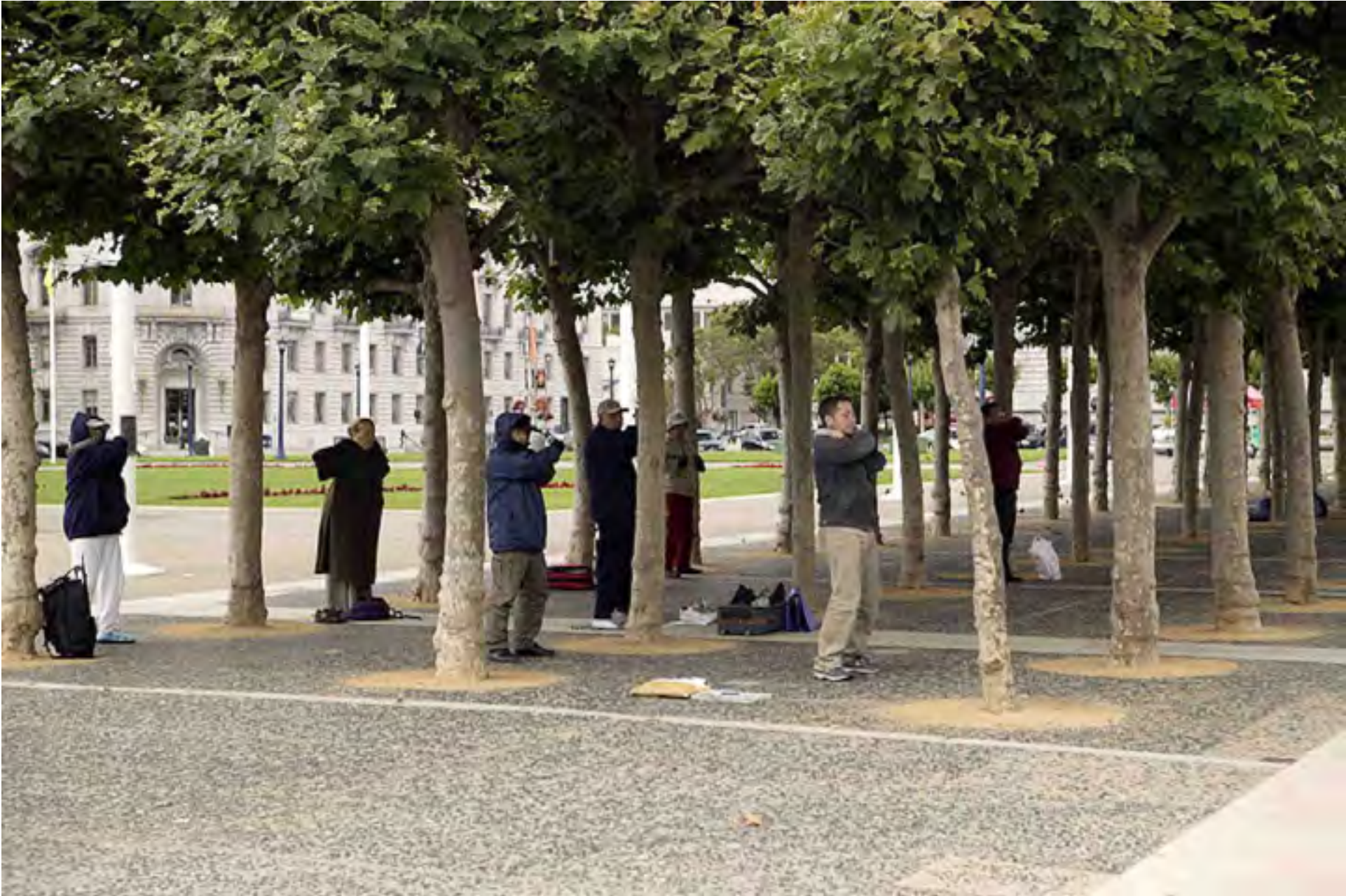
Falun Gong or Dafa doing their morning exercises (September 2009)