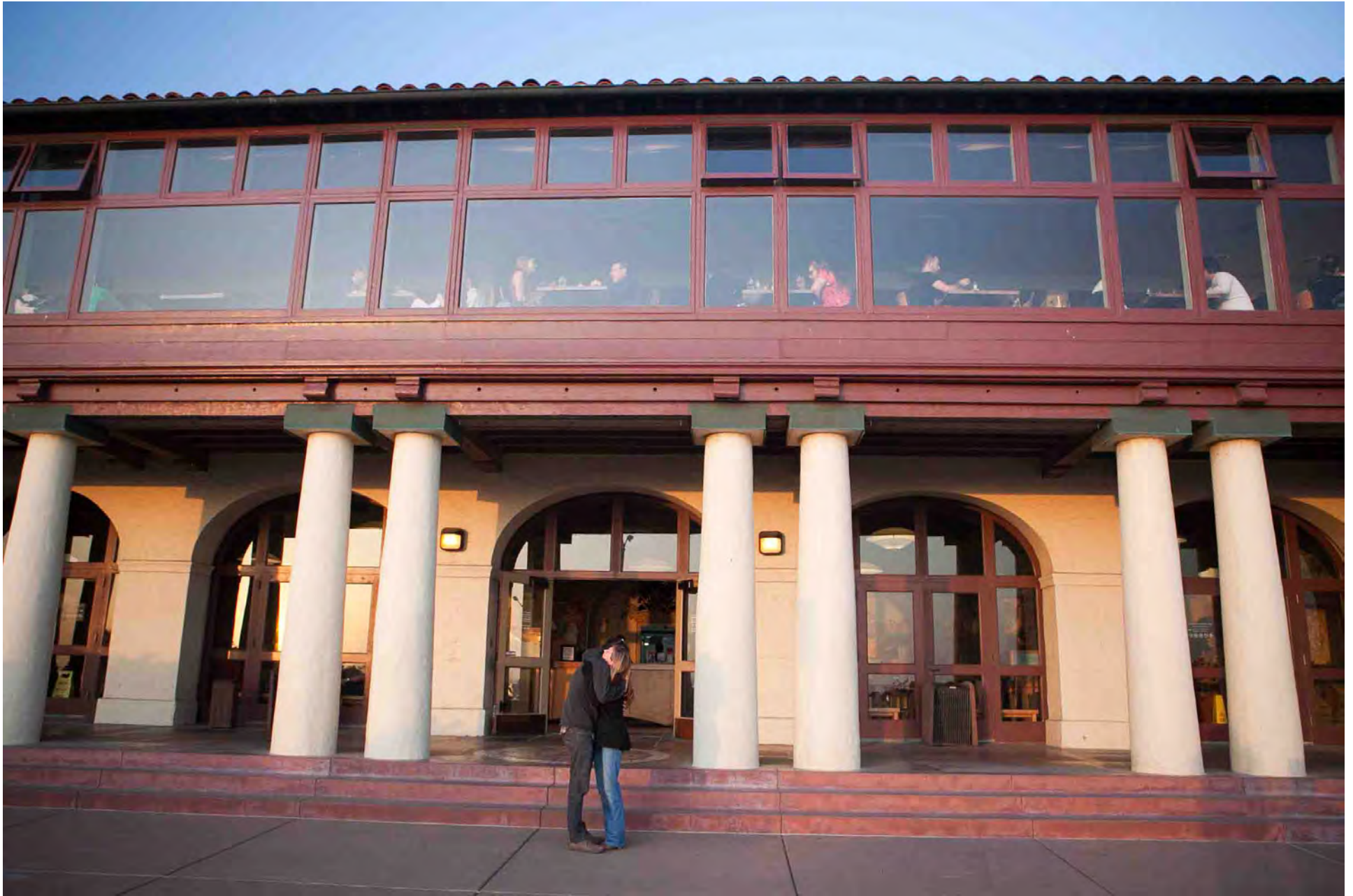
The Beach Chalet is on the edge of Golden Gate Park. It has a long history. It is famed for its WPA murals and mosaics.