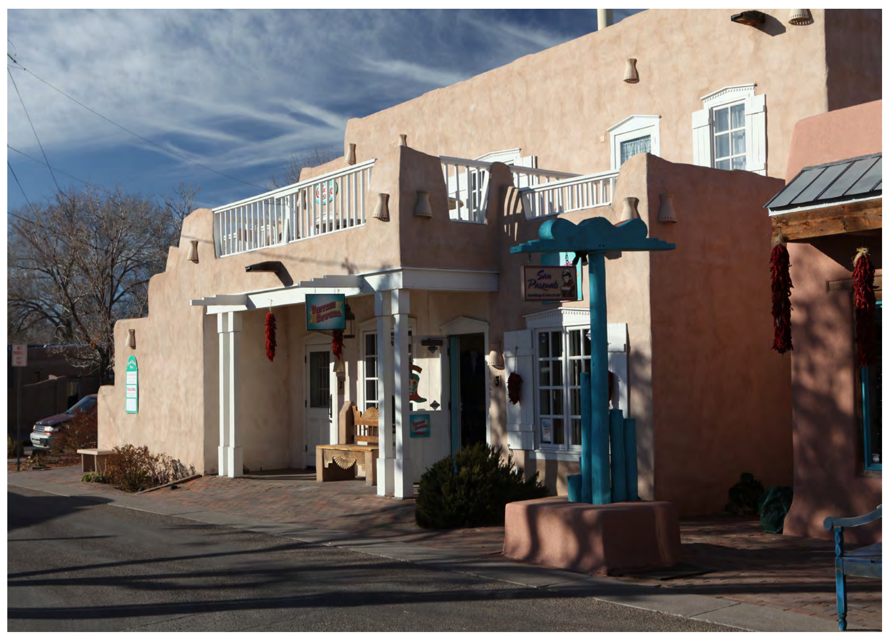
The street behind the church in Old town.