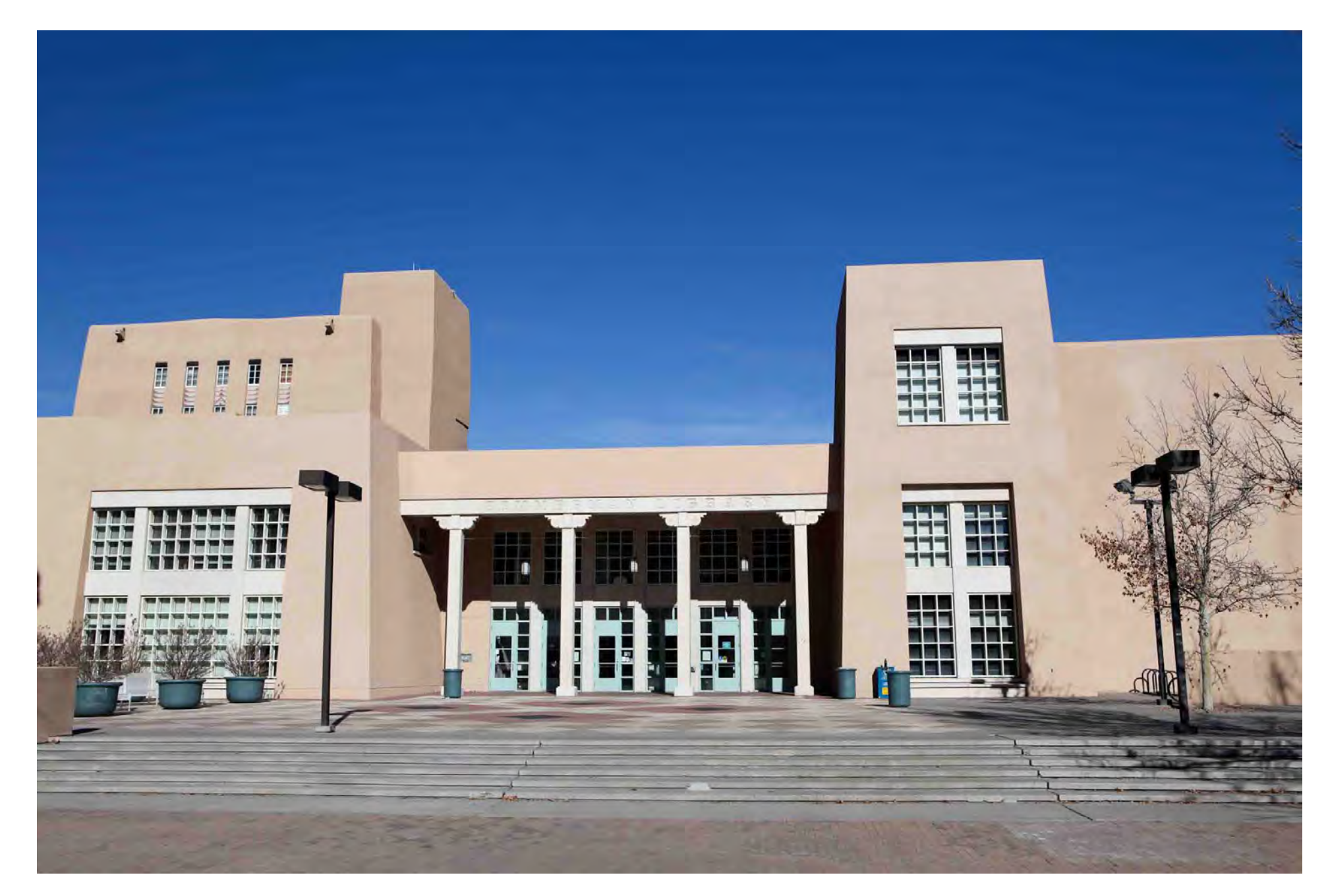
The Zimmerman Library. Campus architecture is done in Navajo Revival style.