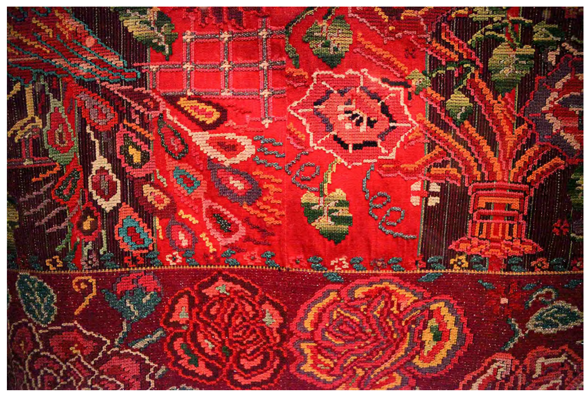
A Mayan weaving in the Maxwell Museum of Anthropology which features native American crafts and arts.