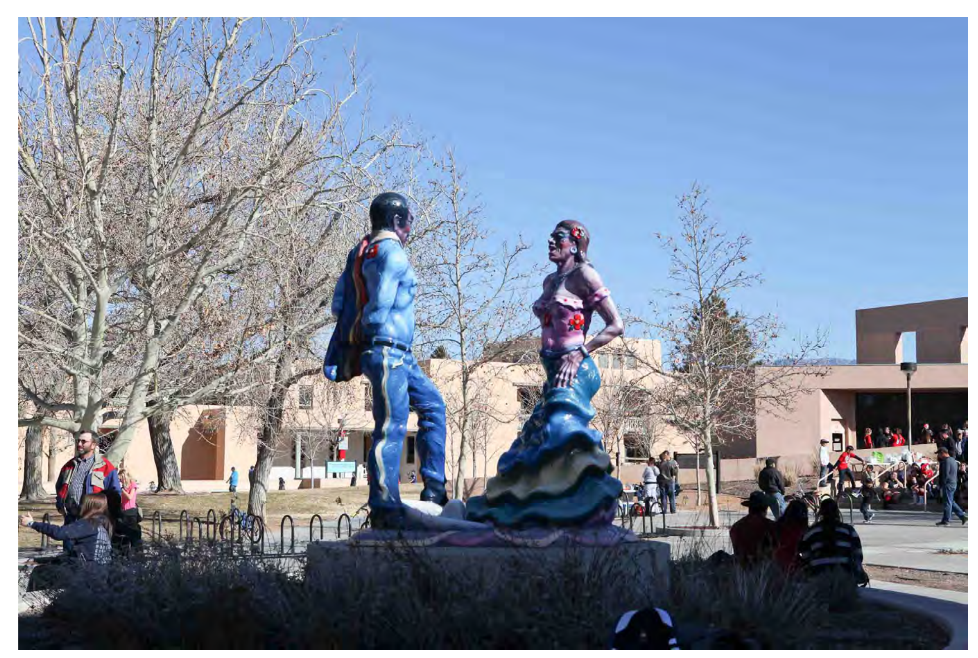
There are plenty of art pieces on campus and on the streets around town.