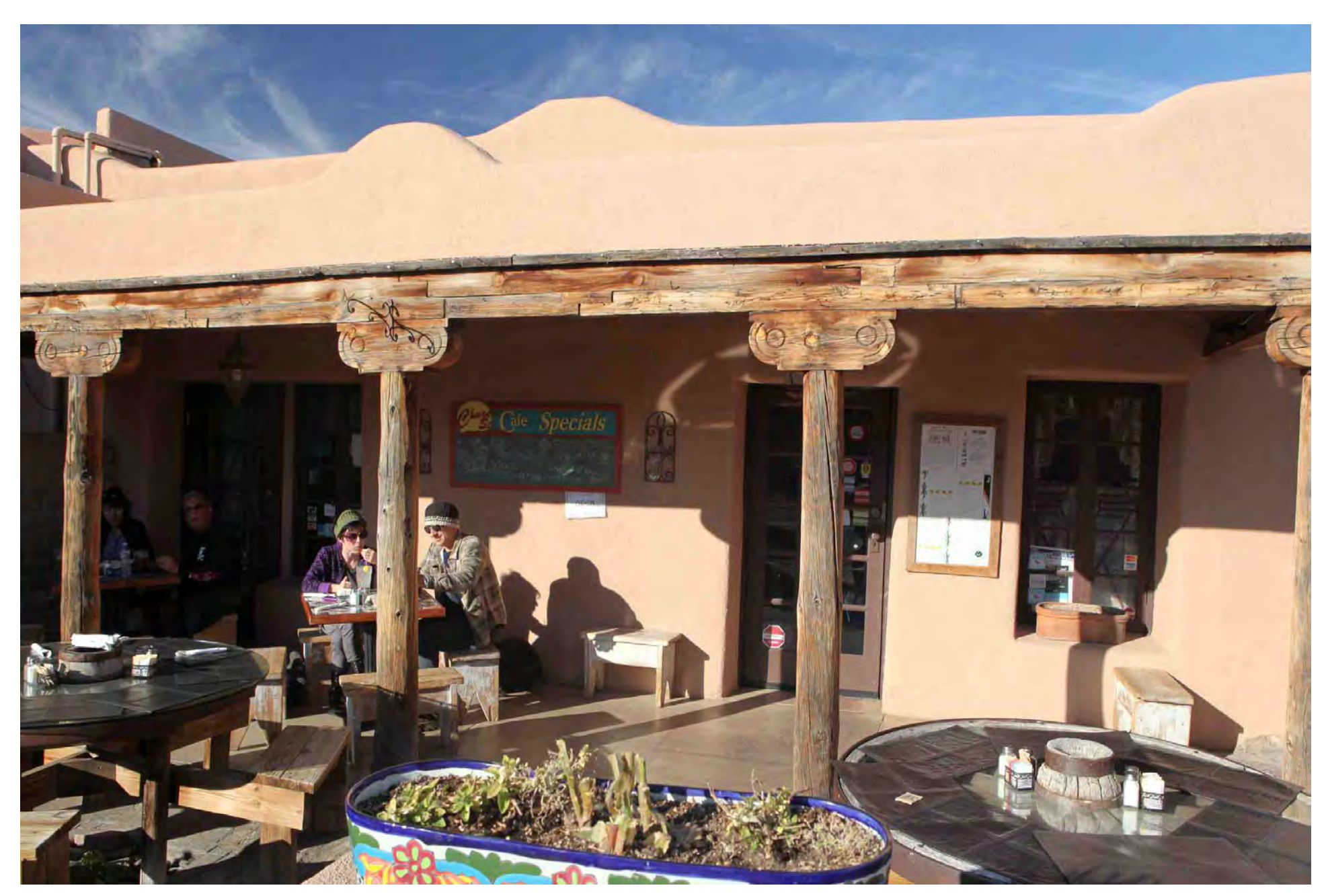
The oldest house in Old Town is now a restaurant.