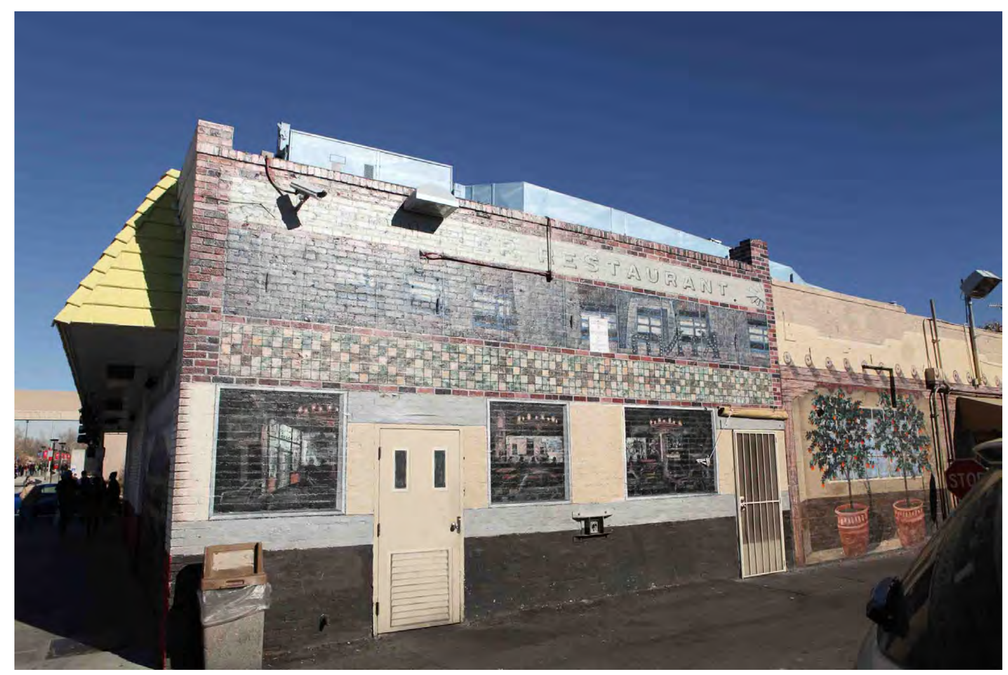
The back of the Frontier Restaurant which is a landmark across from the University.