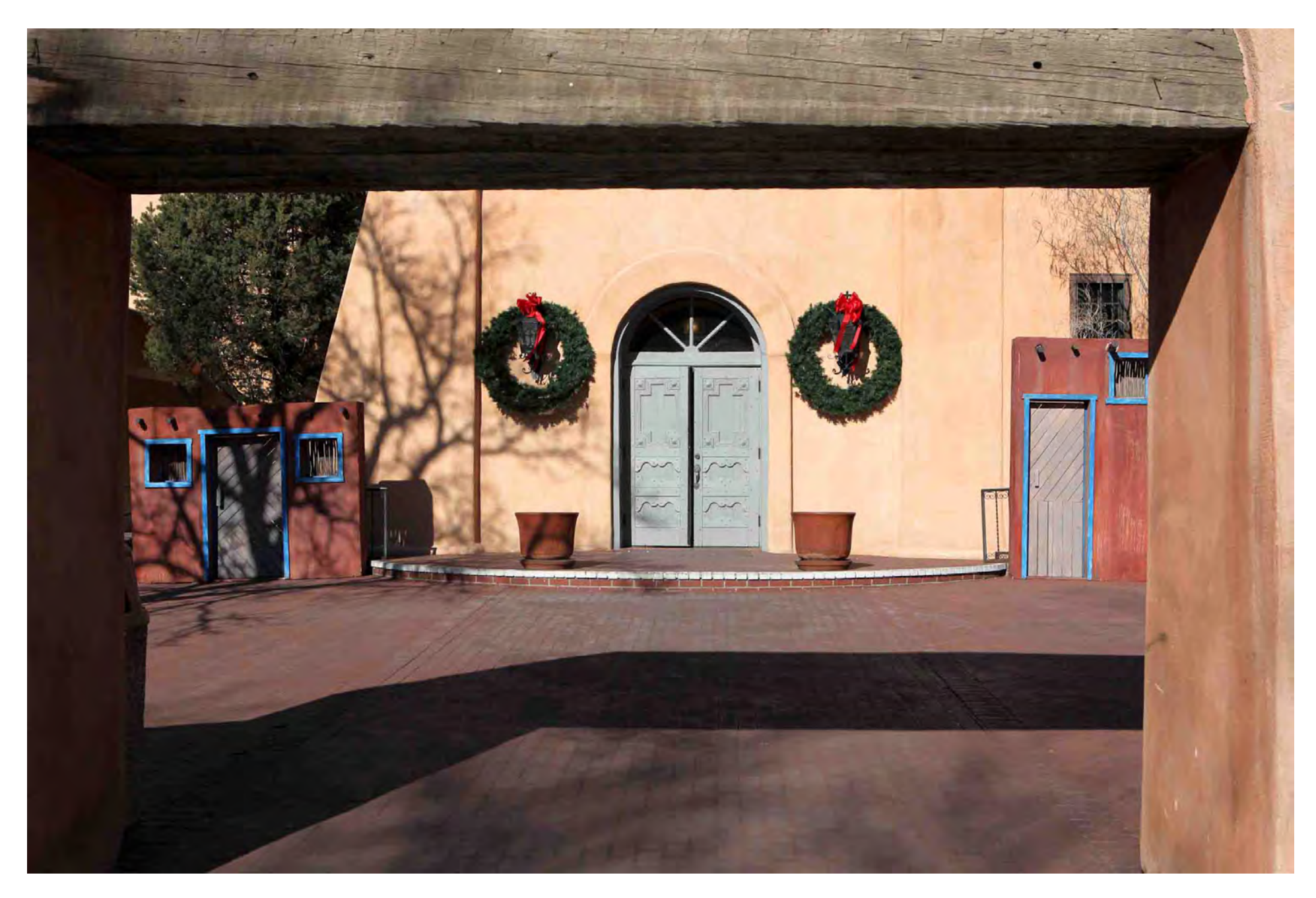
Old Town in Albuquerque dates back to 1709. This is the Catholic Church in Old Town. We photographed only two spots – Old Town and the University of New Mexico on Center St.