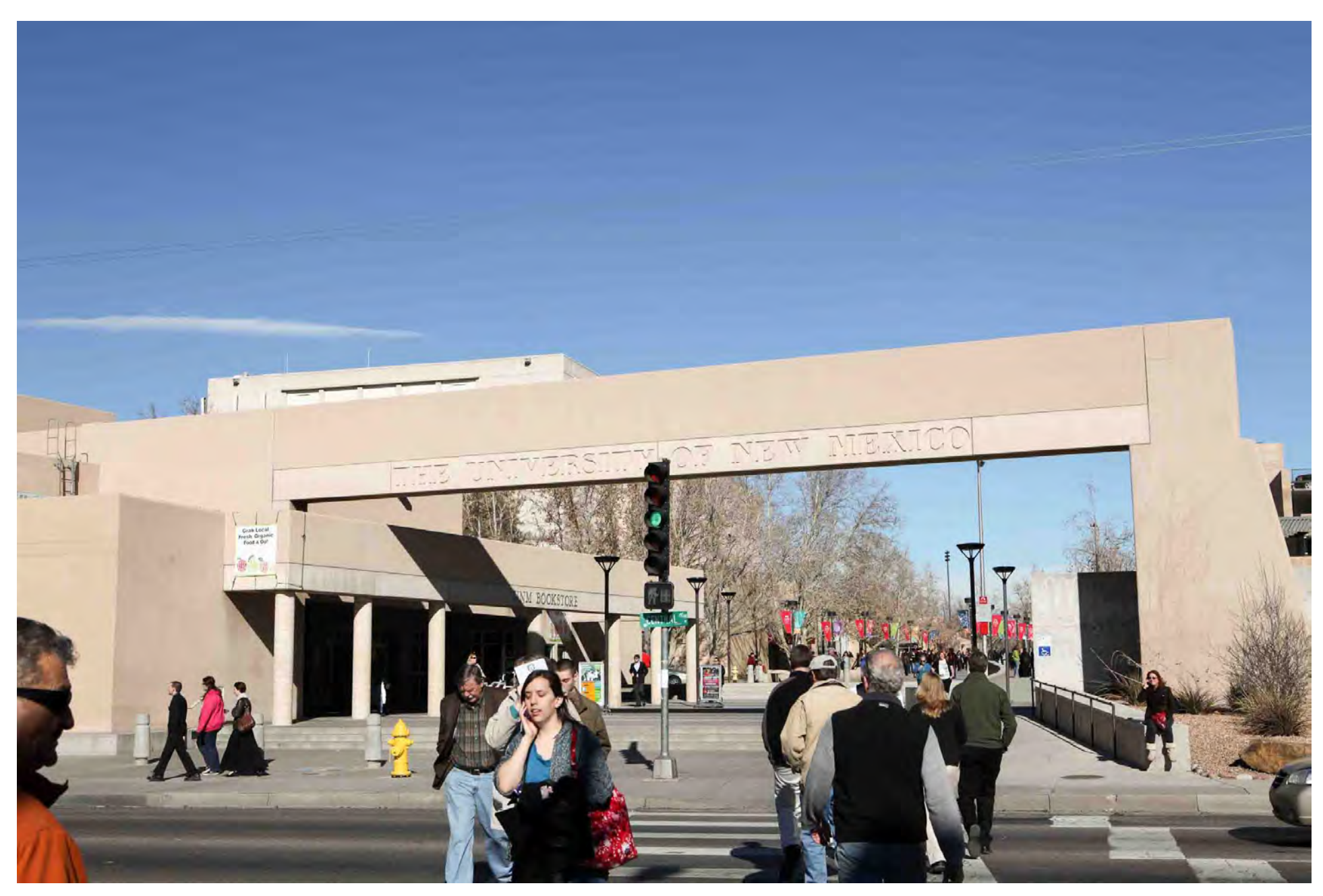
The entrance to the University of New Mexico. This was a saturday and the state high schools were having their state choral and band competition. The school has about 28,000 students and instate tuition is a bargain at about $6,000.