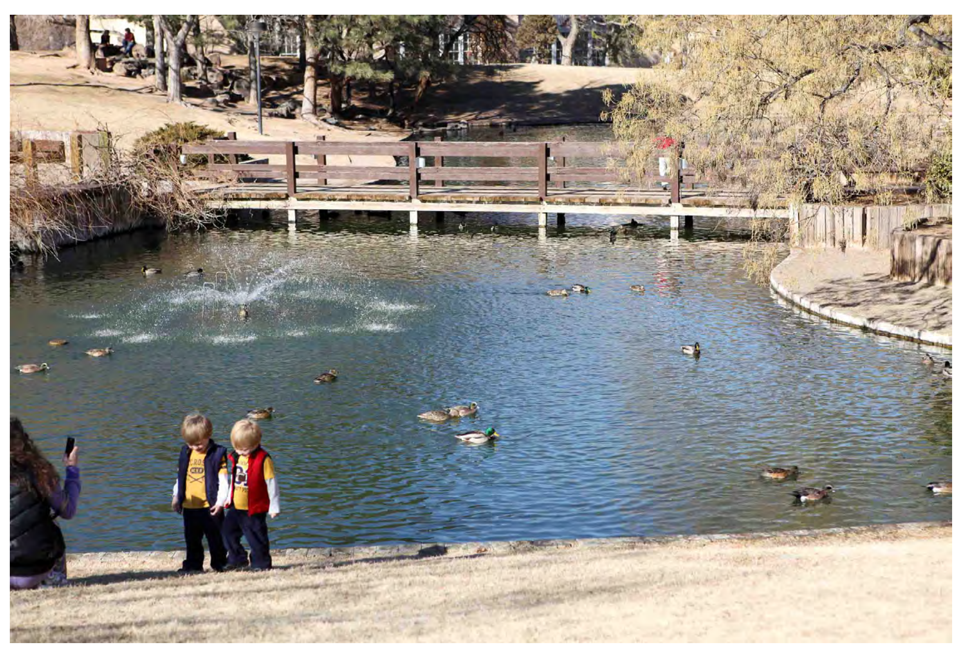
The Duck Pond.